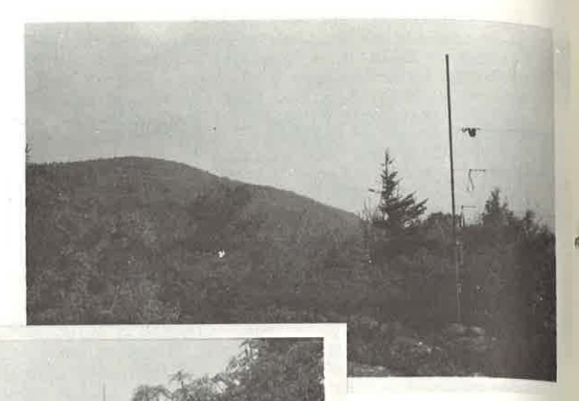
A Lull in Banding Activity

Looking northeast from the banding area. Many birds come around this mountain before coming up the ravine and into the nets.