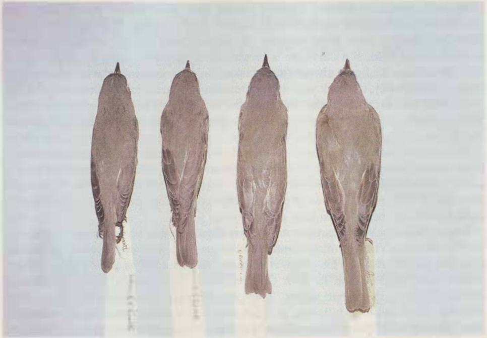
Figure 1: From left to right (1) V. philadelphicus imm. female, Calif. Ac. #40850, 3 Sept 1906, Lyons Cook Co., IL; (2) V. gilvus swainsonii male, Calif. Ac. #40867, 24 Sept 1903, Santa Monica Mts., Los Angeles Co., CA; (3) V. olivaceus male, Calif. Ac. #53451, Deerfield, Lake Co., n.e., IL, 13 Sept 1914; (4) V. flavoviridis male, Calif. Ac. #27842, 16 May 1925, Maria Madre, Mexico. Note that there is very little difference in the shade of the upperparts among all four vireos. The birds were photographed against a neutral gray background. The yellow edging in the rectrices is apparent in the Yellow-green Vireo.