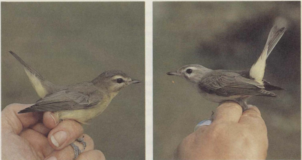
Figure 2: Hand-held Philadelphia (left) and Warbling (right) vireos. Note the generally stubbier appearance of the Philadelphia Vireo as a result of the relatively shorter bill and tail. Also note the length-of-tail to length-of-undertail-coverts ratio difference between the two species. See text for further discussion.