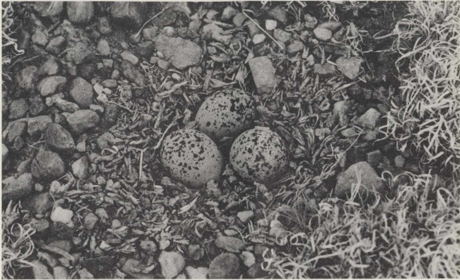
Figure 3. Mountain Plover nest and eggs, Catron County, New Mexico, 12 June 1978. Note lining of pebbles, blue grama Bouteloua gracilis and rabbitbrush Chrysothamnus nauseosus .

Graul (1975) stated that incubating Mountain Plovers crouch low on the nest in response to aerial predators, but we observed different responses. At 1052 a Ferruginous Hawk Buteo regalis flew over the nest. The incubating plover skulked slowly away from the nest, squatting for a few seconds every 3 meters or so, and then finally flew away. The hawk showed no response and continued on its way. The plover returned to the nest and resumed incubating 18 minutes after having left the nest. At 1253 a male American Kestrel Falco sparverius flew over the nest. The incubating plover explosively flew from the nest in a zig-zag pattern. It began calling after flying some 75 meters. The kestrel hovered above the nest briefly and then flew away. The plover had not returned to the nest when the observation period was ended at 1255 (see above).