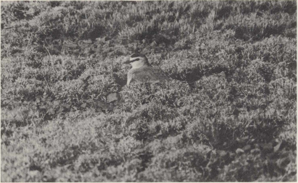
Figure 2. Mountain Plover on nest, Catron County, New Mexico, 12 June 1978. Note position of nest between grass hummocks.

The behavior of the adult plover at the nest was similar to that described for Mountain Plovers in Colorado by Gaul (1973, 1975). Two adult plovers were seen near the nest on 12 June 1978 but we could not determine whether or not only one individual attended the nest. Only one (sex undetermined) was seen at the nest at any one time during 359 minutes of continuous observation (0656 to 1255 MST) on 13 June 1978. An adult was at the nest for 63% of the observation period. The 9 attentive periods observed ranged from 7 to 46 minutes ( \bar{x} = 25 ). The 7 inattentive periods ranged from 5 to 33 minutes ( \bar{x} = 18 ).