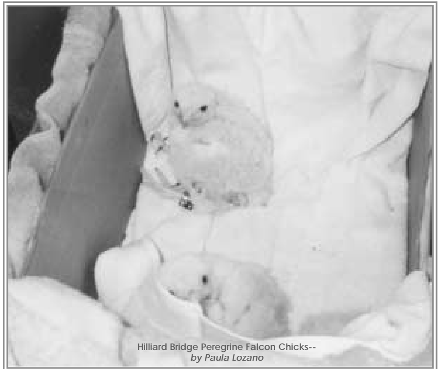
Hilliard Bridge Peregrine Falcon Chicks-- by Paula Lozano

August: Temperatures averaged 69.1°, 1.3° below normal. The high was 88° on the 17th and the low was 51° on the 31st. Sunshine occurred 64% of the time possible. Rain fell on 17 days, totaling 1.80 in., 1.60 in. below normal. The most in a 24 hr. period was .41 in. on the 7th. Lake Erie waters dropped to 73° by the end of the month. ✪