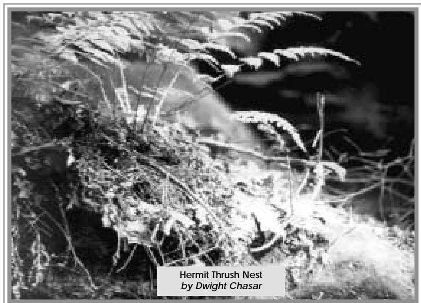
Hermit Thrush Nest by Dwight Chasar

Data from the 1979-98 Summit Co summer bird censuses in June (Tveekrem) show the presence of Hermit Thrush in the county in 83, 84, 97, and 98. It