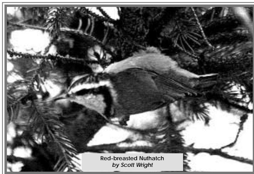
Red-breasted Nuthatch by Scott Wright

Ruffed Grouse continue to be left off most observers' reports. The only reported birds were in Ravenna. Northern Bobwhites have all but disappeared from their usual Portage Co. haunts. In a definite opposite trend to bobwhites, Wild Turkeys are appearing in all 7 counties of the region. Five were along Wheatley Road on Aug. 2 (TMR). At Ravenna, birds (mostly poults) numbered into the hundreds. Lake Rockwell boasted its first successful nest. One crossed Lakeshore Boulevard near the Mentor Wastewater Treatment Plant to vault Hannikman into sole possession of first place in the Headlands area bird listing group. Two Virginia Rails persisted at Ira Road most of the summer (TMR, TLP). Common Moorhens nested at the Hidden Valley Center Wetland (JP).