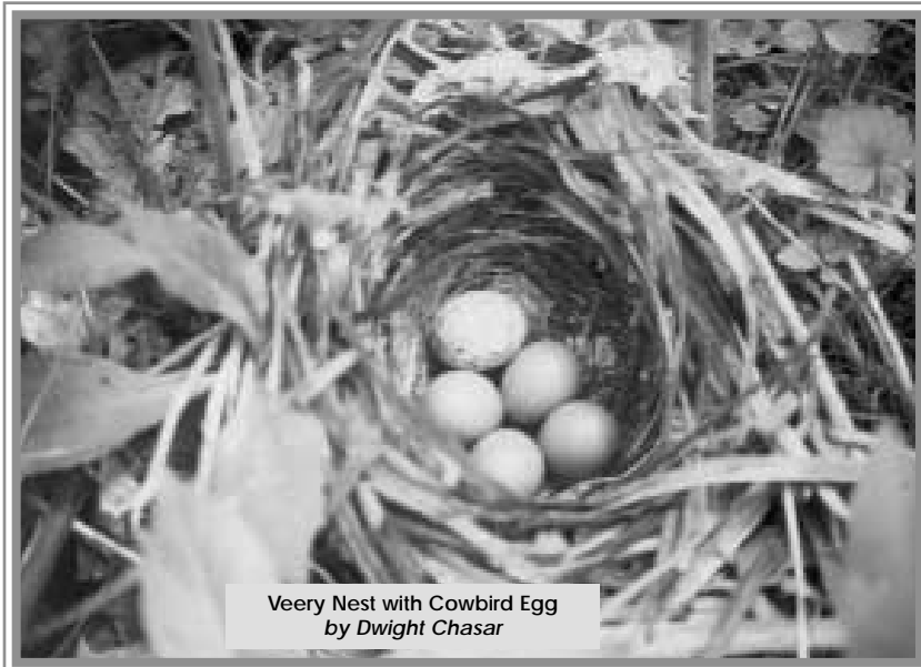
Veery Nest with Cowbird Egg by Dwight Chasar

The first migrant Olive-sided Flycatcher was at Horseshoe Lake on Aug. 27 (BF, BW). One was seen at Villa Angela on Aug. 28 (TLP). Another was at Lakeshore MP on Aug. 8 (JP). Two Yellow-bellied Flycatchers were at Millstream Run on Aug. 9 (SZ). They were found in small numbers at HBSP all through the