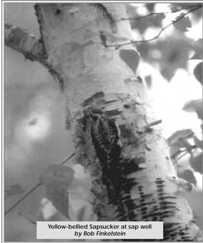
Yellow-bellied Sapsucker at sap well

surveys (JP). Yellow-throated Vireos were fairly common. Philadelphia Vireos were located at HBSP on Aug. 15, 21, & 29 (RH). Warbling and Red-eyed Vireos were found in expected totals.