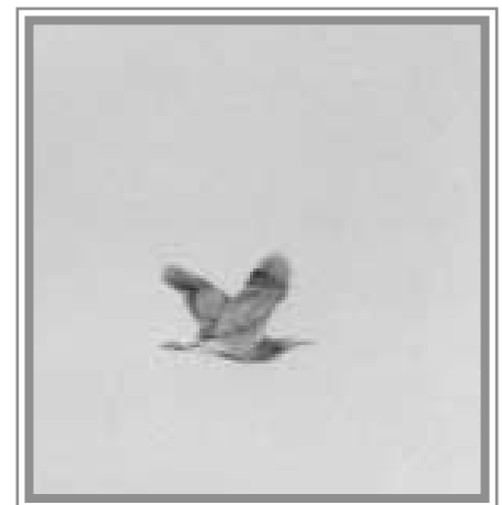
American Bittern at HBSP