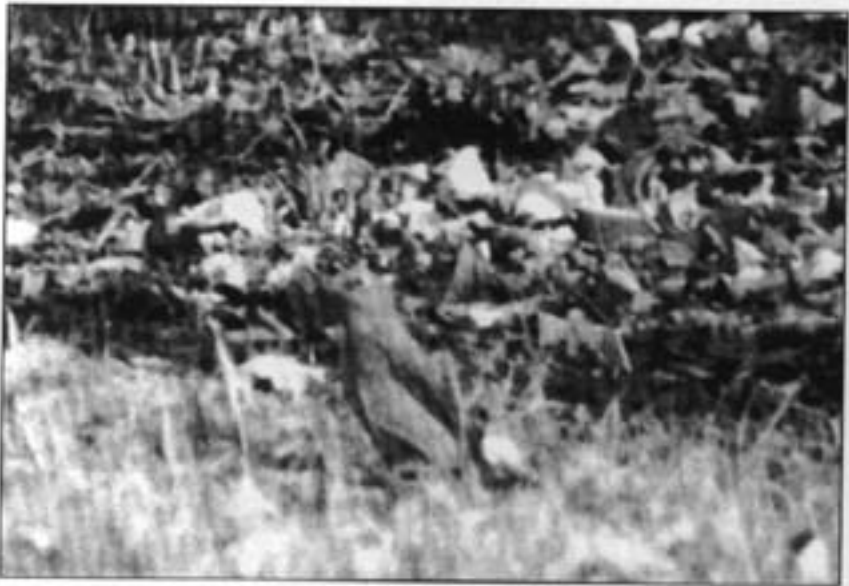
Townsend's Solitaire ( Myadestes townsendi) - 14 November 1994 - Medina, Ohio