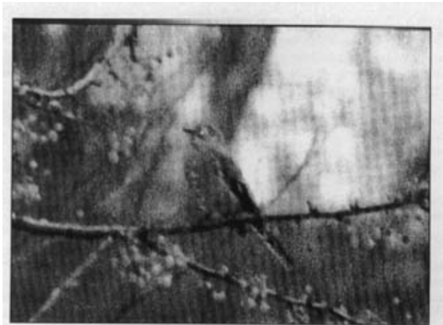
Townsend's Solitaire ( Myadestes townsendi) - 14 November 1994 - Medina, Ohio

PEREGRINE FALCON - One was at Lakeshore MP on 22 Sep.