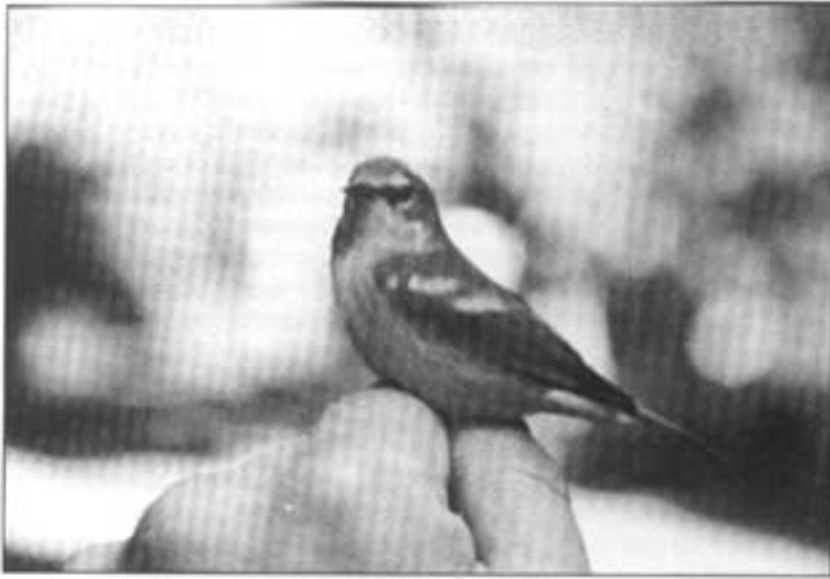
"Brewster's Warbler" - 31 August 1994 Lakeshore Metropark by John V. Pogacnik

winged Swallows were as expected. This year's October Barn Swallow was seen on 22 Oct. (RH).