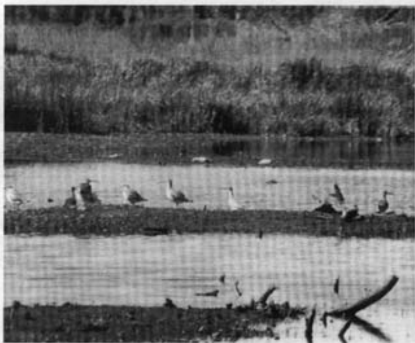
Whimbrels ( Numenius phaeopus) - Mosquito Creek SWA - 27 May 1994

KIRTLAND'S WARBLER - A female was seen at Chagrin River Park on a 15 May Sunday Morning birdwalk. While the