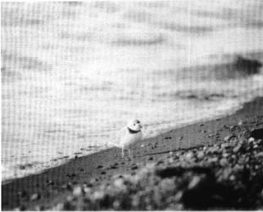
Piping Plover ( Charadrius melodus ) 20 April 1994 -- Headlands Beach State Park

Ten Years Ago: A Golden Eagle soared over the Rocky River Valley on 25 Apr. 1984 (Klamm). An exquisite male Smith's Longspur was at Gordon Park on 6 May (Talkington). A subadult Cattle Egret appeared at Shaker Lakes on 22 May (Fazio). Four Red Knots were at Headlands Beach SP on 20 May (LePage). The first Bell's Vireo for the region was found at Headlands Beach SP on 27 May (Peterjohn, Rosche).