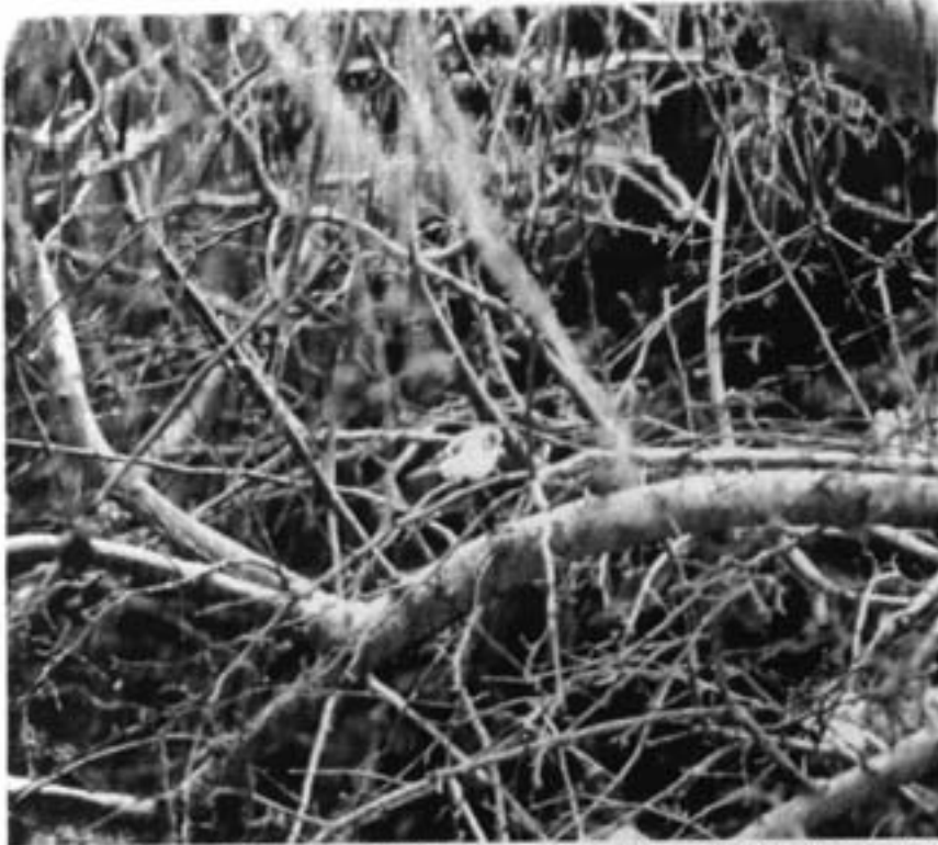
Hoary Redpoll ( Carduelis hornemannii) - Lakeshore Metropark - 16 March 1994