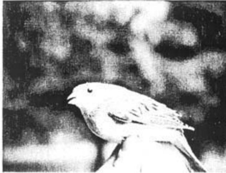
Dickcissel ( Spiza americana) Lakeshore Metropark 17 Oct. 1992

Whip-poor-will - Our only fall report was from Virginia Kendall