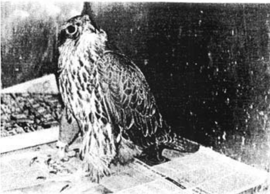
Gyrfalcon ( Falco rusticolus ) Lorain County - November 1992