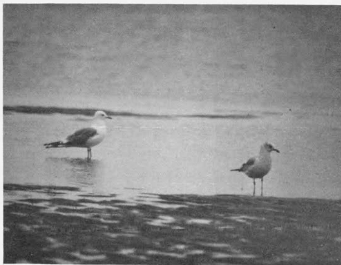
Common Gull (left) in Revere (5/19/80).