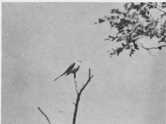
Scissor-tailed Flycatcher, Fort Hill, Eastham, 17 June 1979.

The "Lawrence's" Warbler was reported feeding young on the ground and moving in the grass on June 19. The highlight of the month was the report of a singing Tennessee Warbler at Wellfleet Bay Wildlife Sanctuary. The bird was observed singing 10+ times before it flew off. A Yellow-throated Warbler on Nantucket in early June was a hold-over from May.