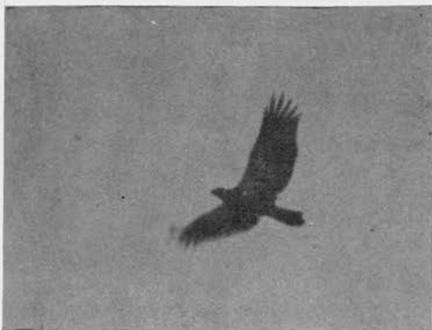
Immature Bald Eagle, Plum Island, 23 June 1979