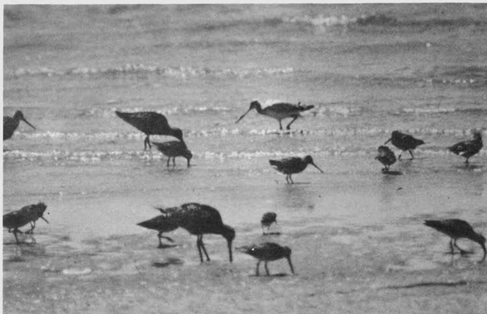
Bar-tailed Godwit with Hudsonian Godwits and Dowitchers