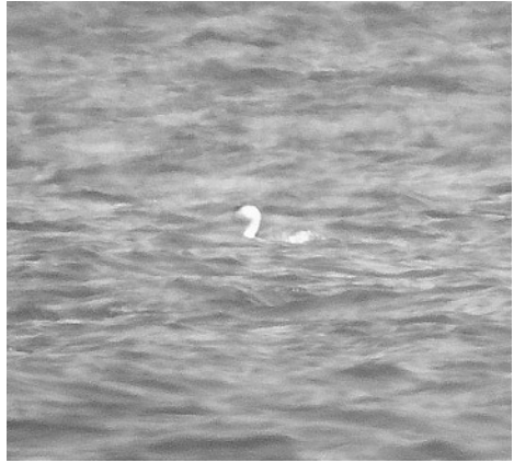
Figure 1. Photograph of Clark's Grebe off Owl's Head Light, Owl's Head, Maine, March 12, 2005. Even at distances of 300–500 yards, the bright orange-yellow bill and pale flanks were clearly visible.

For the next three weeks, a number of birders were able to visit nearby Owl's Head Light State Park in Owl's Head, Knox County, and observe the bird from shore, usually 300–600 + yards offshore. Several observers noted the brightness of the bill, a character that seemed inconsistent with Western Grebe. On March 12, Vickery observed and digiscoped the grebe with an Olympus C-4000 through a Swarovski telescope. Although the bird was 300-500 yards offshore, the photos clearly showed a bird with a very bright yellow-orange bill, white face, and gray flanks, and Vickery suggested that these features cast doubt on the identity of this individual as a Western Grebe (Figure 1). This image was not adjusted in any way.