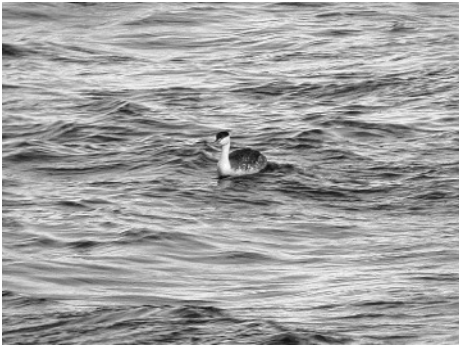
Figure 2. Photograph of Clark's Grebe off Owl's Head Light, Owl's Head, Maine, March 15, 2005. The grebe was photographed approximately 100 yards offshore in deep shade. Despite the poor light conditions, the bright bill, dark culmen, black crown, white supraloral area, and smudgy grayish flanks were all apparent.

tilted its bill upwards, exposing the under side. The lower mandible was entirely bright orange-yellow, and the base (inner third) of the bill was a brilliant, intense "Day Glow" or "Mineola" orange, much brighter than the rest of the bill.