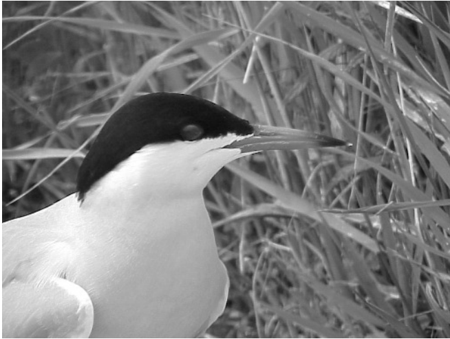
NESTING COMMON TERN