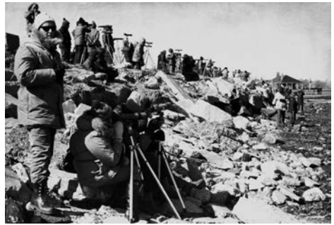
VIEWING THE ROSS'S GULL BY MIKE LASALANDRA (THE NEWBURYPORT DAILY NEWS, MARCH 10, 1975)