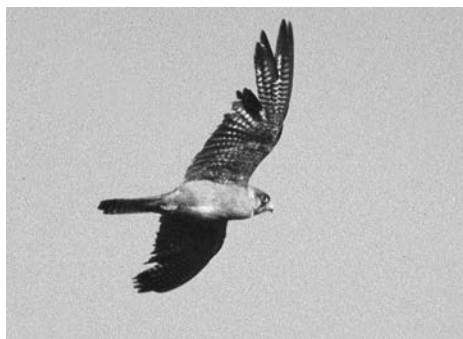
RED-FOOTED FALCON BY PETER ALDEN