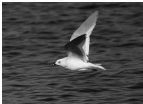
ROSS'S GULL