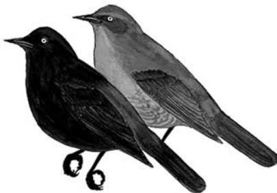
RUSTY BLACKBIRDS BY GEORGE C. WEST