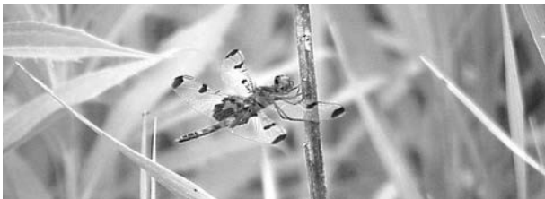
CALICO PENNANT