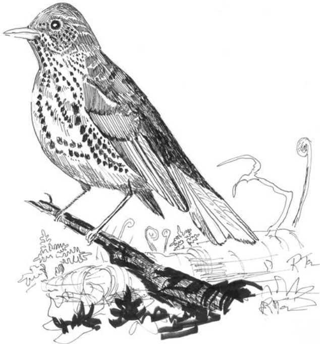
WOOD THRUSH BY ROBERT TOUGIAS

At the start of the trail, look for Blue-gray Gnatcatchers, Gray Catbirds, Common Yellowthroats, and Wood Thrushes, from May to October. If you travel quietly toward the beaver pond, you may see a Great Blue Heron feeding patiently along the water's edge. Although this is a small body of water, these majestic wading birds are