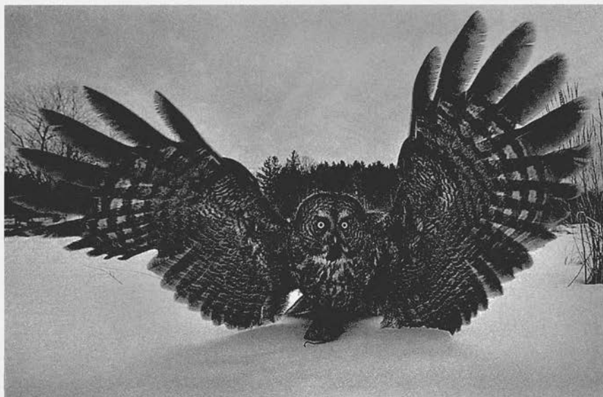
GREAT GRAY OWL

The owl would have done okay on its own, but over the course of a week, two prominent photos (both of my doing) of the owl ran in the Boston Globe . The first photo showed the owl coursing over a field, hunting voles. That ran on the first page of the Metro section. Several days later, the photo you see here ran on page one. At the Globe , the phone started ringing. People wanted prints of the owl. The woman that handled print request calls was ready to kill me. "I'm sick of that owl," she yelled to me. Apparently she was the only person to feel that way, since hundreds of people