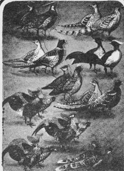
Plate by John Henry Dick from "A Field Guide to the Birds of India." (Actual plate is in full color.)

Several agencies will be offering birding tours to India in 1976. How will they compare?