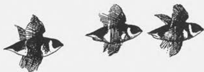
Dovekies by David A. Sibley