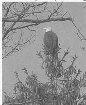
The Arlington eagle

time went on, I realized that my pleasure came not just from seeing the bird, but from sharing it both with the people on the e-mail list and with non-birders in our area. Other birders on the e-mail list felt the same way, and "sharing the eagle" became a subject of our e-mail discussion. The following excerpts from our electronic conversation highlight this very social aspect of birding, as well as the special kind of pleasure that comes from seeing a good bird on your home turf.