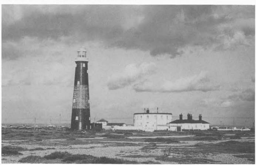
Dungeness, Kent. The barren shingle ridges hide tangled hollows full of migrants. The Observatory is in one of the cottages.

Seawatching. Unfortunately, pelagic trips are almost unheard-of in Britain, so you must go to Cape Clear in southwestern Ireland for the best seawatching, although I am told that a few pioneers are starting to explore off the west coast of England too. This all changes, however, whenever a Caribbean hurricane follows the storm track up the Gulf Stream and hits Britain with a major gale. Then, seawatchers flock down to St. Ives in Cornwall to see the spectacular flights of storm-driven pelagic species streaming back south down the Atlantic coast. Thousands of Gannets (Northern Gannet) and Kittiwakes (Black-legged Kittiwake) are accompanied by Pomarine (Pomarine Jaeger), Arctic (Parasitic Jaeger), and Great skuas, divers, shearwaters, petrels, and alcids—a birding sight that has to be experienced to be believed.