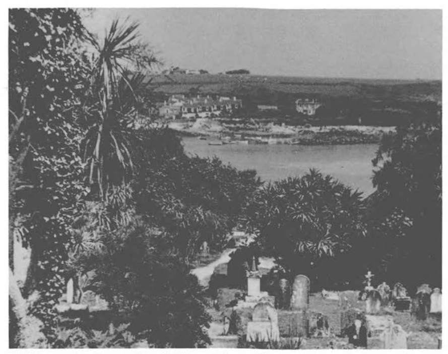
Old Town churchyard, The Scillies. A favorable wind can pack these palm trees with migrants and exotics.

more demanding. Most New England backyards produce only a handful of winter residents, but my mother's garden in Britain boasts more than twenty species. Thrushes and titmice, pigeons and crows, woodpeckers and a Nuthatch (Sitta europaea), a Wren (Winter Wren), a Tree Creeper (Certhia familiaris), and a variety of finches come to bird tables for food while farmlands still hold Sky Larks, Red-legged and Grey partridges, Lapwings, Corn Buntings, and Yellowhammers. A good day at a southern reservoir should produce a dozen or more species of freshwater and bay ducks, often including a Smew or even a Ring-necked Duck. Most British raptors are resident, too.