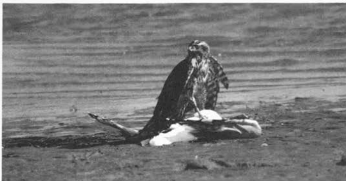
Immature Goshawk eating Herring Gull Gay Head, Martha's Vineyard, MA October 12, 1986