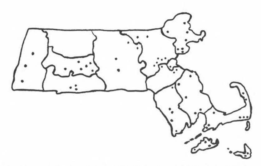
Figure 1. Summer distribution of Short-eared Owls based on Forbush, 1927.