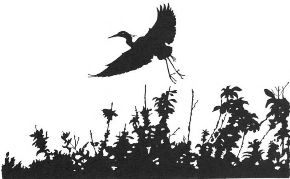
Illustration by William E. Davis, Jr.

Access to this section is from South Pleasant Street, from the campgrounds in the off-season or if you camp, or from the first access road on the right (0.3 mile) after well-marked Mt. Blue Spring. (The spring is a magnet for local people. Bring a few