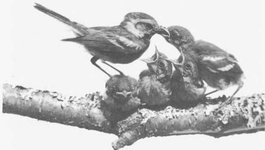
Black-throated Green Warbler

By returning on the road that brought you to Heron Pond and turning right at the reservoir, you will come into a more upland