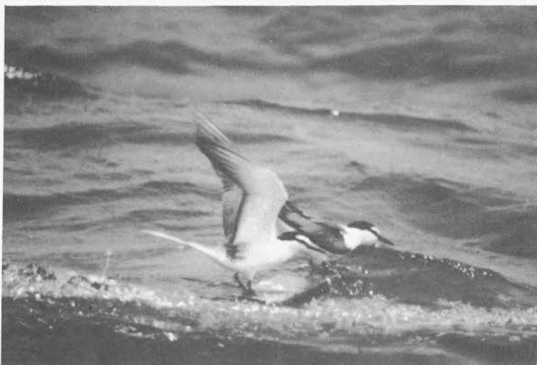
Bridled Terns Dry Tortugas, April 1985

Bush Key, in the Dry Tortugas, hosts nesting colonies of Sooty Terns (up to forty thousand pairs), Brown Noddys (a few thousand pairs), and Roseate Terns (about a hundred pairs). The Tortugas also provide roosts for Brown and Masked boobys, and for the last two years a single pair of Masked Boobys has attempted to nest on one of the islands.