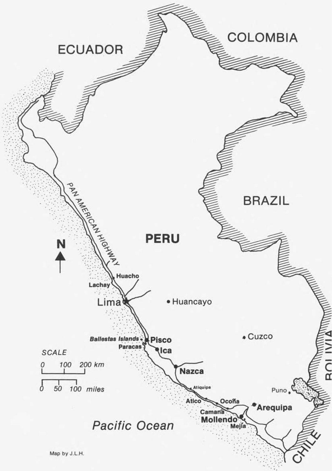
Map by J.L.H.