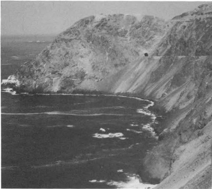
Coastal hills and tunnel North of Ocoña, Peru