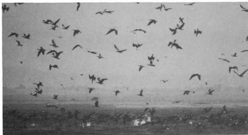
Big feeding flock, cormorants and boobies Paracas, Peru

The south side of the peninsula is rockier, with steep cliffs that plunge into the deep. The fishing village of Lagunilla has some rocky intertidal areas, good for Blackish Oystercatcher, Whimbrel, Surfbird, and that amazing passerine - the Seaside Cinclodes, the only species of landbird to spend its life on the Peruvian rocky seashore, feeding on small marine animals. Beyond is a series of high cliffs with views down to Southern Fur Seals,