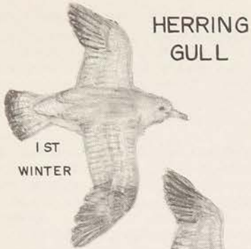
1 ST WINTER