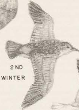
2 ND WINTER