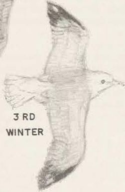
3 RD WINTER