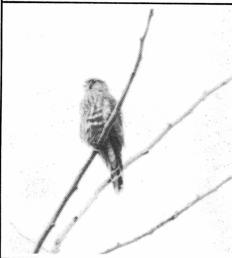
Figure 3: Juvenile Merlin, Confederation College, 3 August 1986.

1986), Marathon, Thunder Bay District (Escott 1977), and, for the first time in 1986, Silver Islet, Thunder Bay District. In these areas, the population density appears to be lower than in Thunder Bay, and more typical of the densities found in the traditional breeding areas of uninhabited boreal forest.