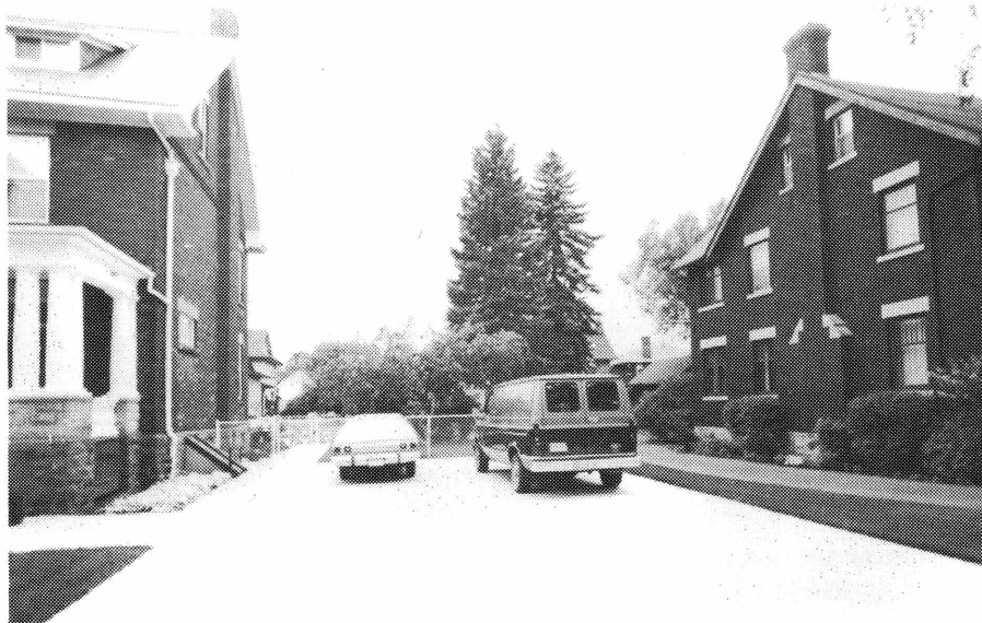
Figure 2: Nest tree of the Vickers Park pair. The Merlins nested near the top of the taller of the two spruce trees in this urban backyard.

and on 28 July a family group of four was found at the west end of the lake, perched on dead snags and the tops of spruce trees.