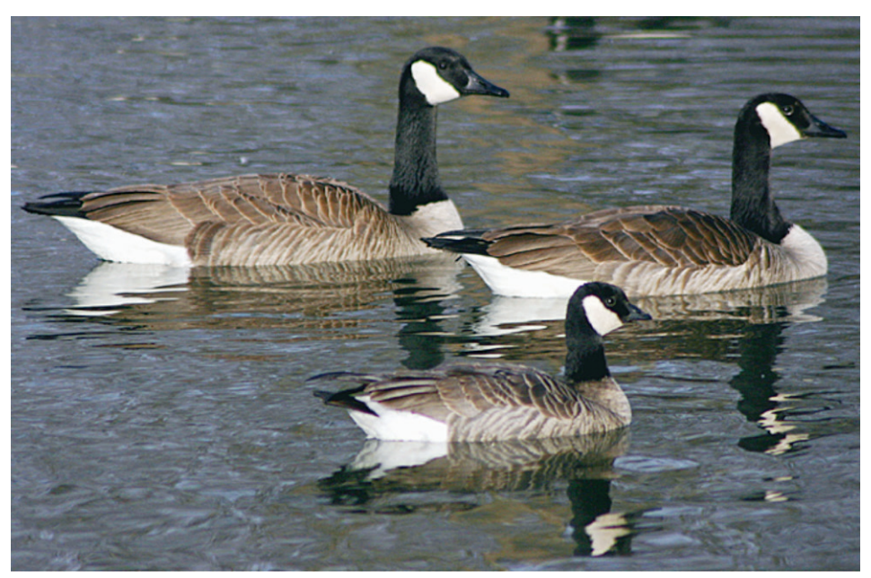
Figure 1. "Richardson's" Cackling Goose with Canada Geese at Fishery Park in Erwin, Unicoi County, TN. Photo by Bryan Stevens, January 2006.