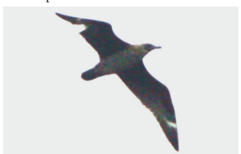
Figure 5. South Polar Skua on Pickwick Lake in Hardin County.