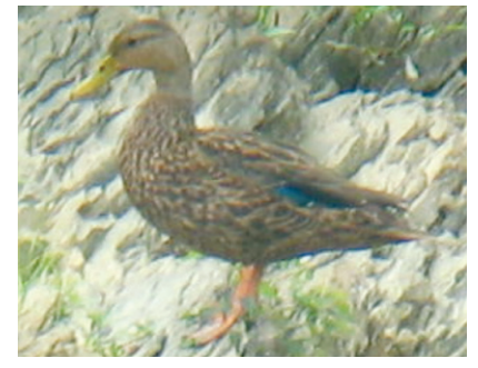
Figure 2. Male Mottled Duck at Douglas Lake, Jefferson and Cocke Counties, TN. 9 September 2006.

Written documentation by Dean Edwards and photographs by David Johnson (Figure 2) were submitted for a male Mottled Duck at Dutch Bottoms on Douglas Lake in Jefferson and Cocke Counties. The bird was initially found by Edwards on 5 September 2006 and subsequently seen and photographed by many observers through at least 9 September 2006. The record was accepted with a vote of 6-0 becoming the second accepted record of Mottled Duck in Tennessee and the first from East Tennessee. The species is currently listed as Accidental on the Official List.