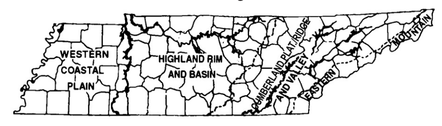
1 March - 31 May 2012

March was one of the warmest on record statewide, with new high temperature marks set in numerous locations. As a result, vegetation emerged earlier by three weeks or more. The following two months were also generally warmer than usual. A brief cold snap in mid-April brought frost to some areas, but was only a minor setback. Numerous new early arrival dates were established in various sections of the state. However, overall numbers of migrants seemed low. Thus it is likely that the warm temperatures, favorable winds, and general lack of rains during the peak of migration allowed many migrants to pass over the state before stopping. Early breeding also was noted for some species.