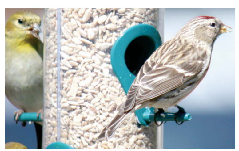
Figure 7. Common Redpoll at feeder with American Goldfinches in Lewis County.