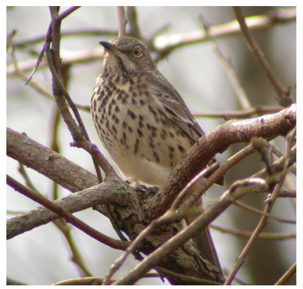
Sage Thrasher found at Lyons Bend, Knox County, Tennessee.