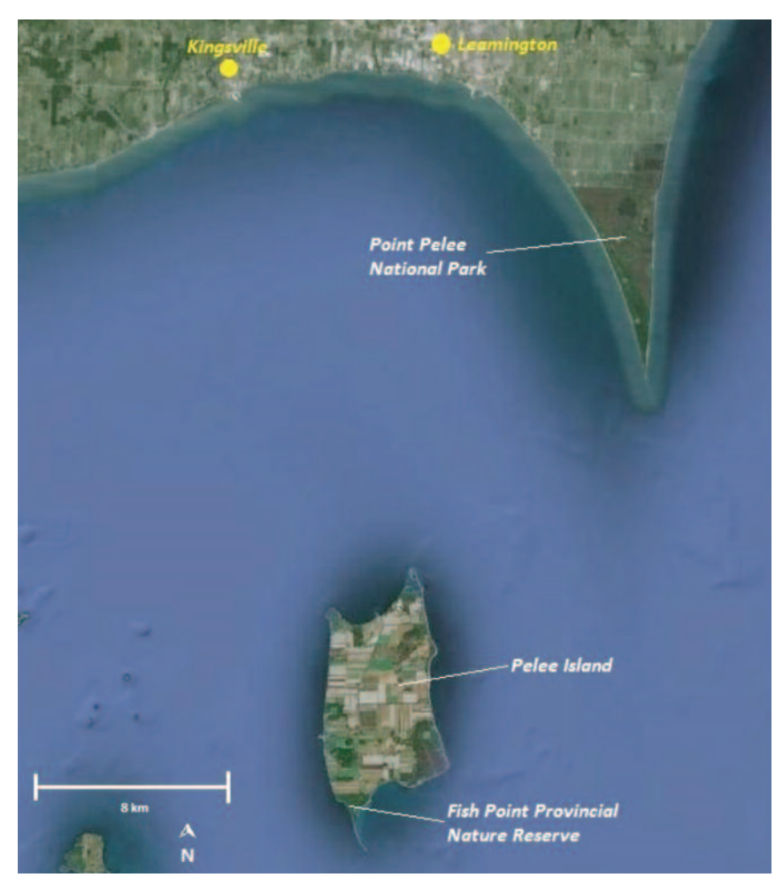
Figure 1. The Pelee region, showing the locations of both study sites (Fish Point Provincial Nature Reserve and Point Pelee National Park).

noted among Neotropical species (Sauer et al. 2014), we wanted to know if there were significant differences in composition and abundance of Neotropical-wintering versus temperate-wintering migrant species. Finally, we wanted to compare differences in composition and abundance of species between the mainland and island study sites.