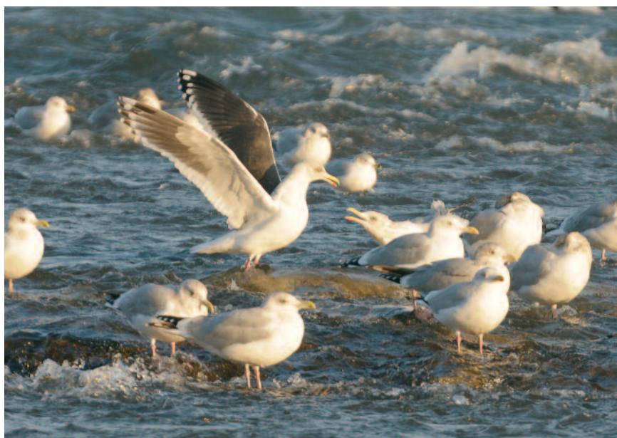
Figure 13: Slaty-backed Gull at Niagara Falls, Niagara from 3-13 December 2011. (8 December).