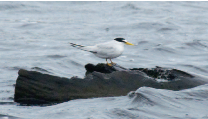
Figure 14: Least Tern on 10 May 2011 at Atikokan, Rainy River .