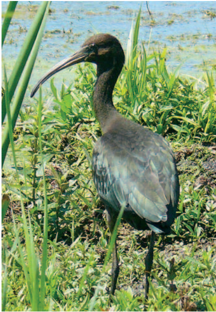
Figure 6: Plegadis Ibis at Lakeview Heights (Cornwall), Stormont, Dundas and Glengarry from 23 July to 10 August, 2011. Photo: Dawn Scranton (28 July)