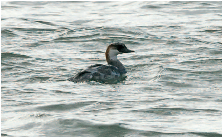
Figure 26: Male Smew at Whitby, Durham on 26 December 2011.

This species does exhibit a tendency to wander and there are two accepted records for the province (Roy 2001). However, consensus could not be reached regarding wild origin. Three members of the current committee have agreed to research the wild status of Smew and report to the 2012 committee.