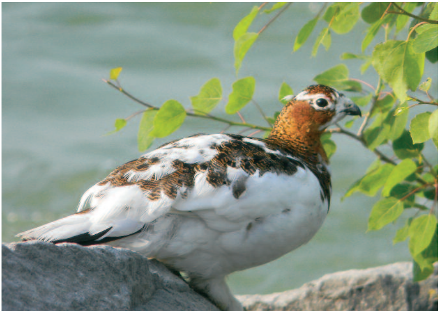
Figure 2: Willow Ptarmigan Darlington Generating Station, Durham from 8 June to 30 November 2011. Photo: Wayne Holroyd (8 June).