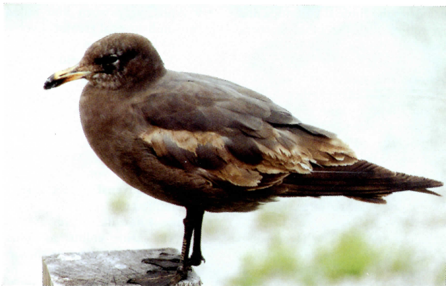
Figure 3: New dark grey Basic II median coverts and Alternate I scapulars on 25 May 2000.