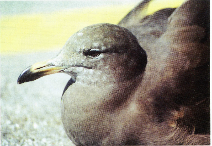
Figure 5: Scattered Alternate I whitish head feathers and eye crescents on 30 June 2000. Some whitish feather tips have worn off.