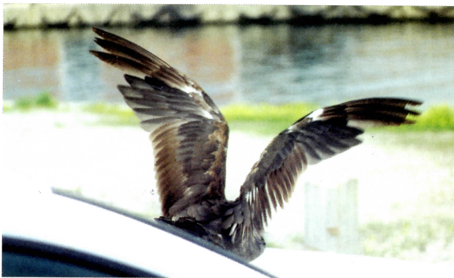
Figure 4: Heavy primary molt on 11 June 2000, showing new Basic II primaries 1-6, with primaries 5 and 6 partly grown, primary 7 shed, and primaries 8-10 being retained Juvenal feathers. White quill bases of the primaries show where primary coverts have shed. Browner secondaries have not yet molted.