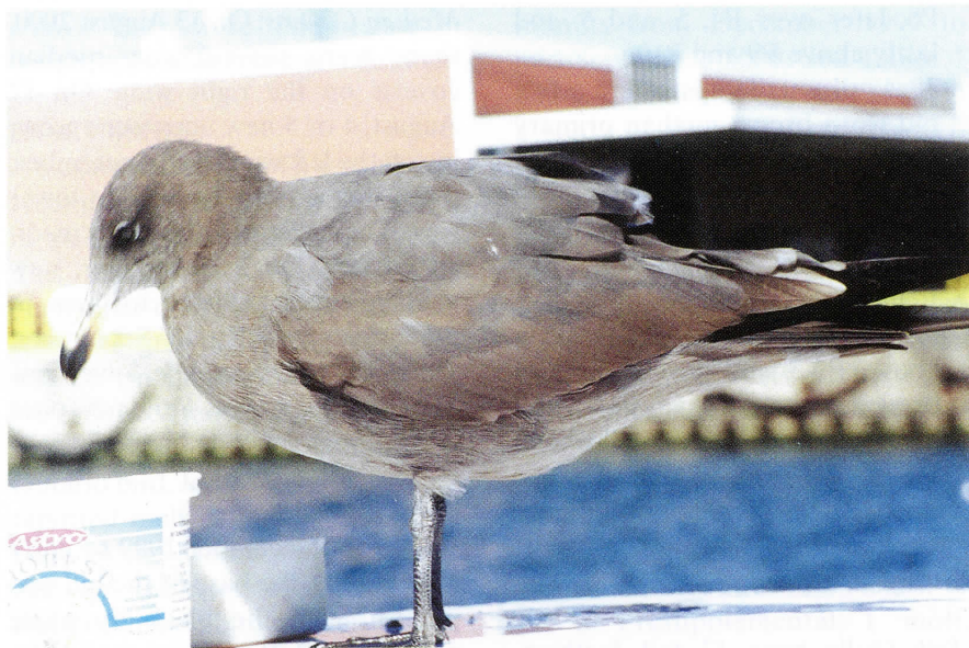
Figure 7: Basic II plumage on 7 September 2000. New grey median coverts and some new tertials indicate a probable Supplemental I plumage.