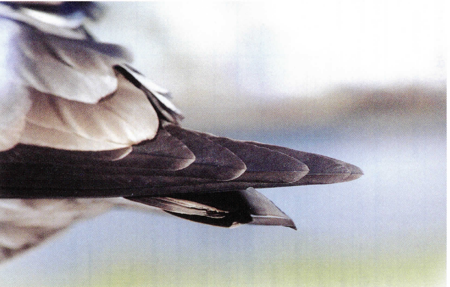
Figure 9: Fully grown Basic II primaries on 15 September 2000.

After the Basic I plumage was acquired (which apparently included a few median coverts), some tertials and median coverts molted two more times. After Basic I, we considered the first molt of the tertials (five on each wing) and median coverts to be part of the Prebasic II molt, and the second molt of some tertials and median coverts after mid-August to be a Presupplemental I molt. Another interpretation is that the first molt of the tertials and median coverts was part of the Prealternate I molt, and the second molt was part