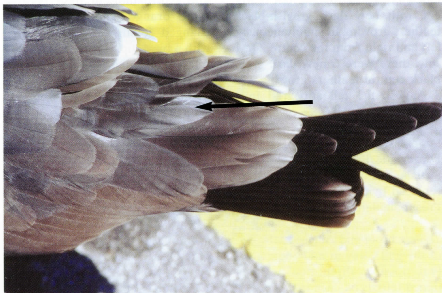
Figure 8: Arrow indicates new, whitish-tipped tertial growing on 7 September 2000, which is apparently part of the Presupplemental I molt.