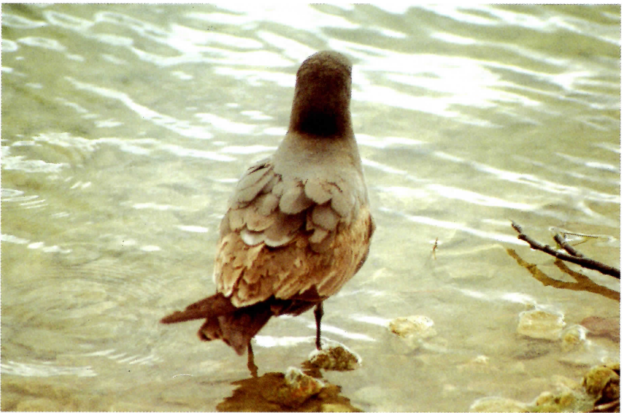
Figure 2: Alternate I long, pale-tipped, posterior scapulars (subscapulars) on 30 March 2000. Compare with Figure 6.