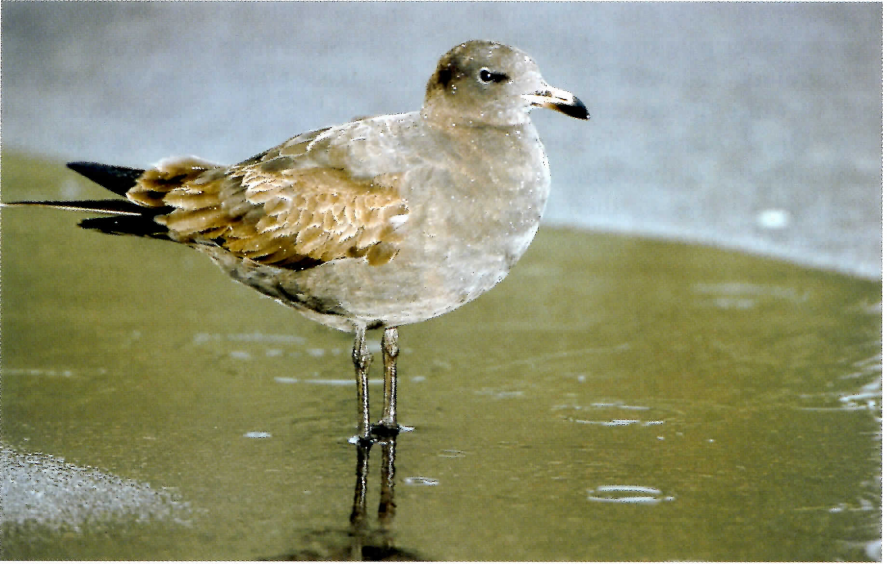
Figure 1: Basic I plumage on 2 December 1999, showing molt contrast of older, worn, brownish Juvenal wing coverts and tertials, with newer fresh greyish Basic I head, body, and scapular feathers.