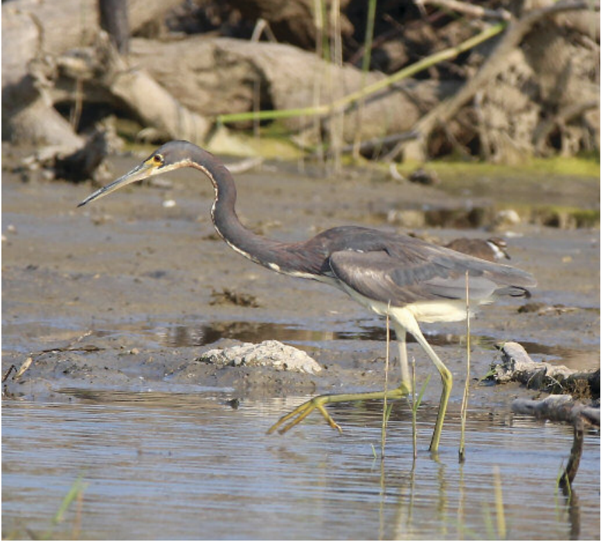
Figure 7. Tricolored Heron at Toronto (Tommy Thompson Park), Toronto on 21 July 2017.