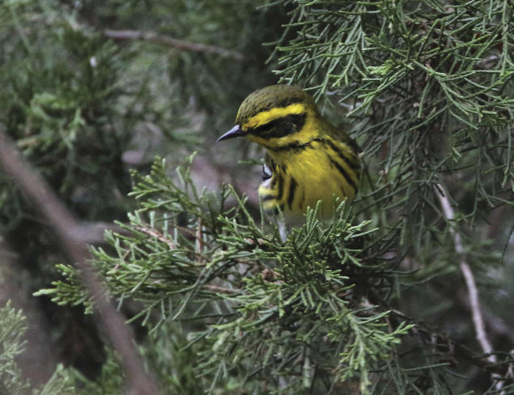
Figure 21. Townsend's Warbler at Rondeau Park, Chatham-Kent on 22 November 2017.