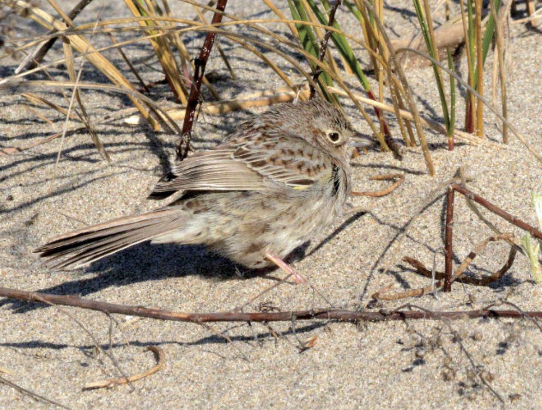
Figure 22. Cassin's Sparrow at Long Point (Tip), Norfolk on 24 April 2017.