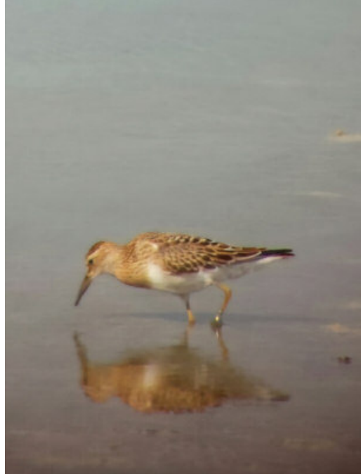
Figure 11. Upper right: Sharp-tailed Sandpiper at Exeter, Huron on 3 September 2017.