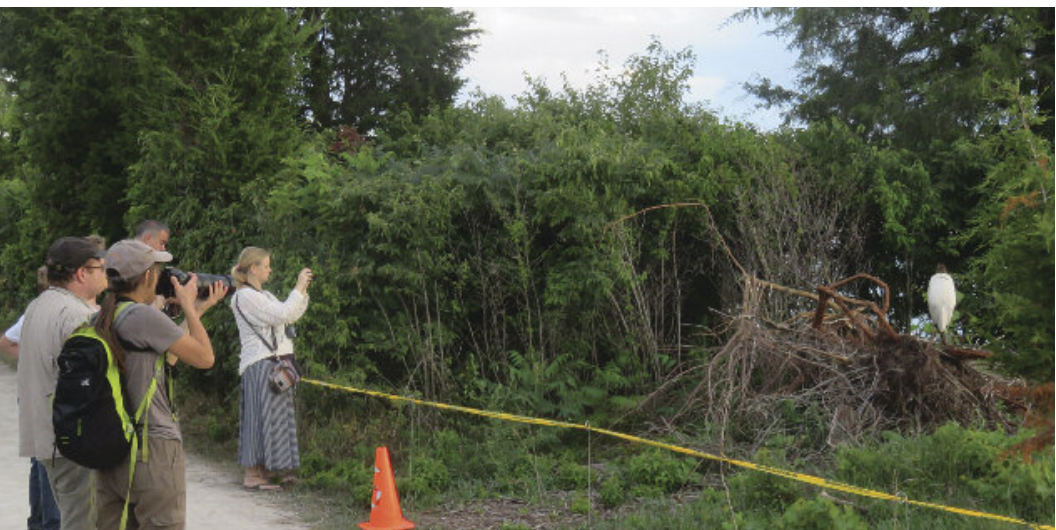
Figure 5. Birders enjoying the incredibly tame Wood Stork at Point Pelee National Park, Essex on 12 August 2017.