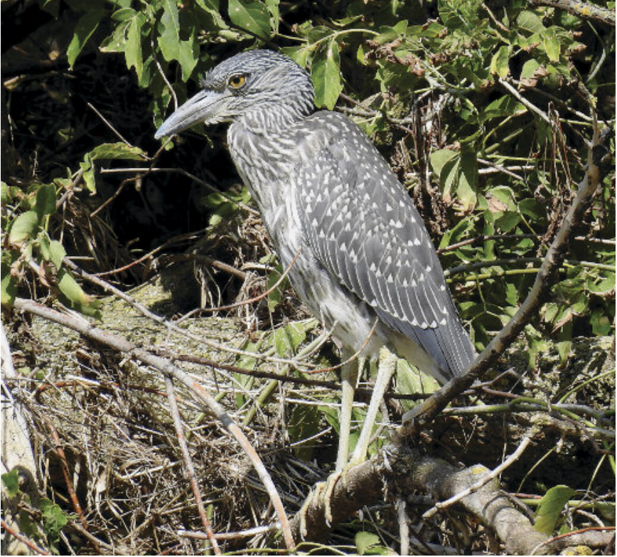
Figure 8. Yellow-crowned Night-Heron at St. Jacobs, Waterloo on 2 September 2017.