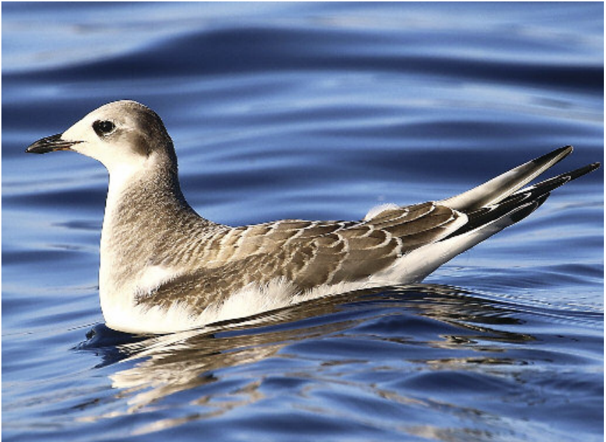
Figure 14. Sabine's Gull at Bedivere Lake, Thunder Bay on 22 September 2017.