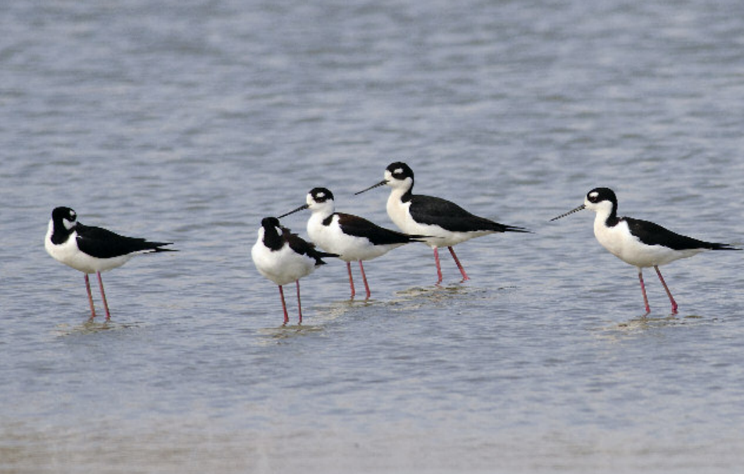
Figure 10. Black-necked Stilts at Windsor, Essex on 15 April 2017.