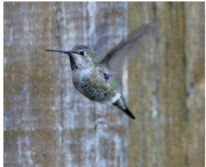
Figure 15. Anna's Hummingbird at Carleton Place, Lanark on 10 November 2017.

A close runner-up for bird of the year! Just the third provincial record, this was the first individual that was accessible to southern Ontario birders. As such, hundreds of individuals were able to enjoy this bird during its stay.