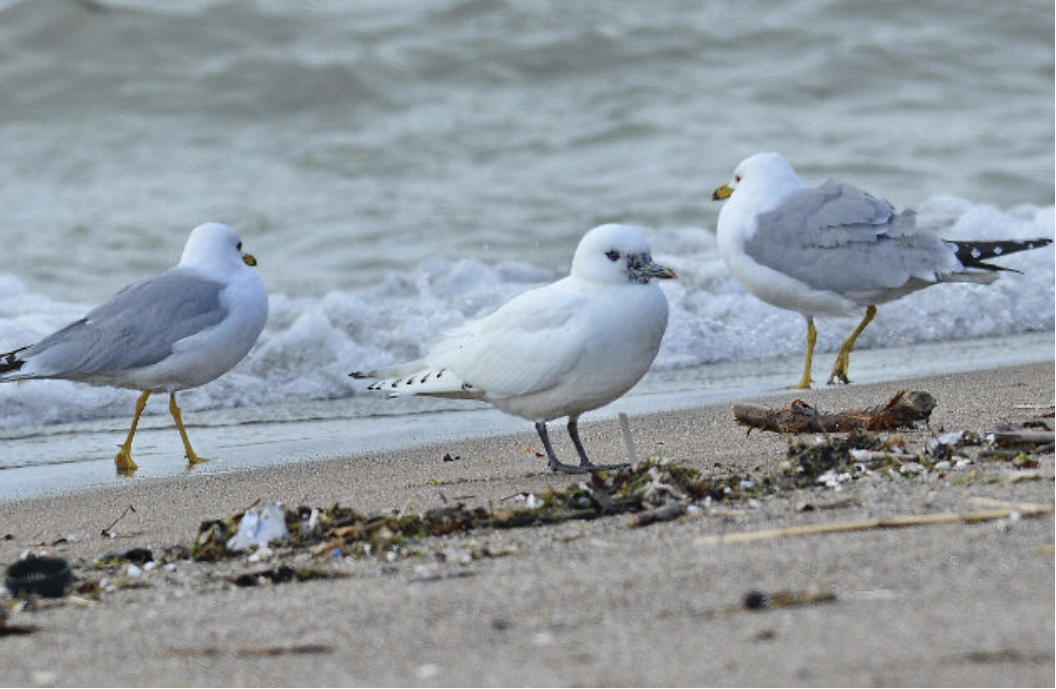
Figure 13. Ivory Gull with Ring-billed Gulls ( Larus delawarensis ) at Colchester, Essex on 3 March 2017.