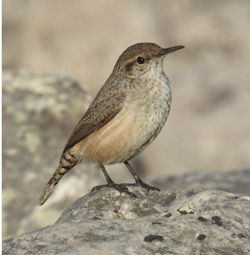
Figure 19. Rock Wren at Boulder Beach, Bruce on 8 October 2017.