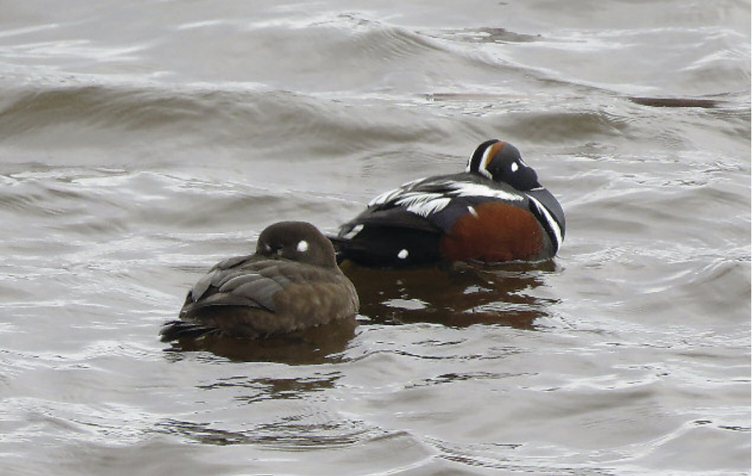
Figure 3. Harlequin Ducks at Connaught, Cochrane on 28 April 2017.