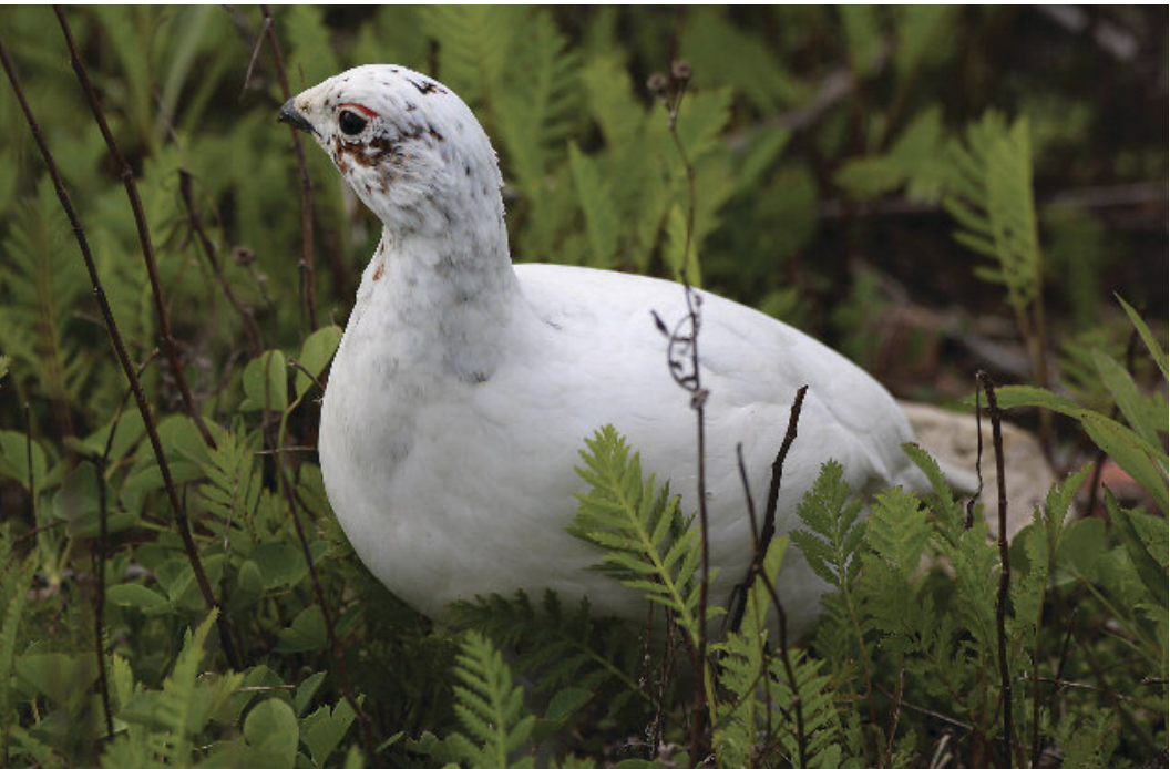
Figure 4. Willow Ptarmigan at Toronto (Tommy Thompson Park), Toronto on 13 May 2017.