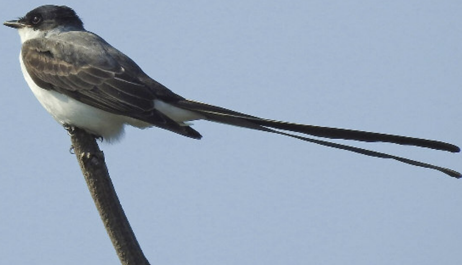
Figure 17. Fork-tailed Flycatcher at Toronto (Tommy Thompson Park), Toronto on 24 September 2017.