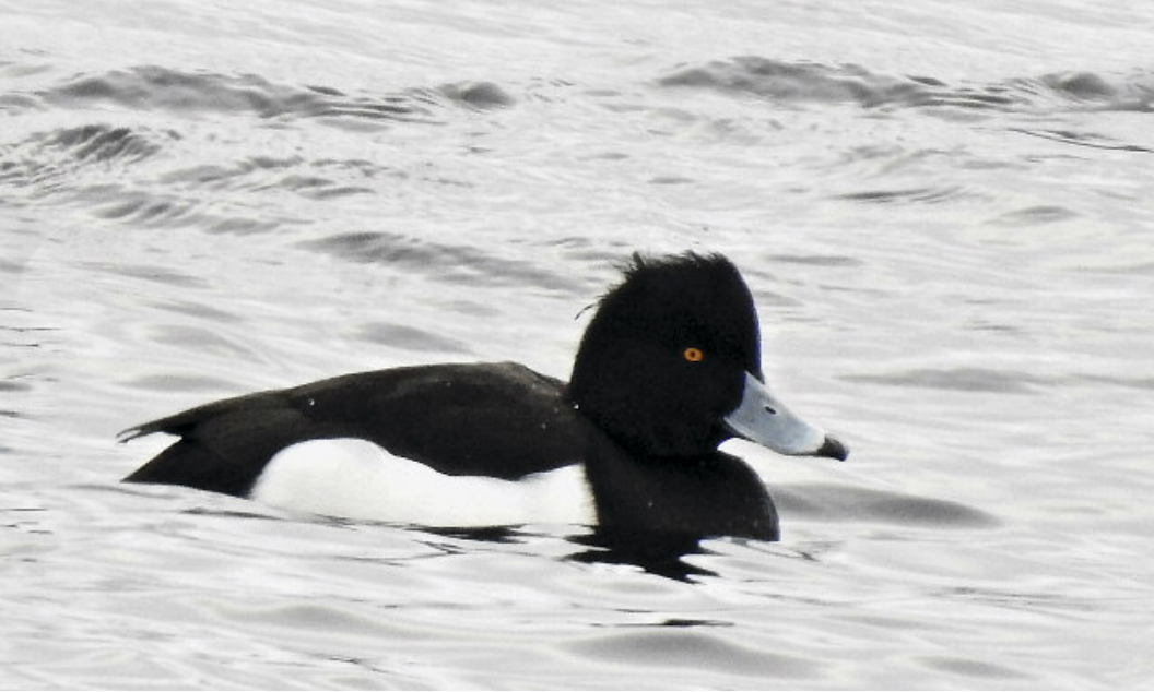
Figure 2. Tufted Duck at Mississauga, Peel on 17 December 2017.