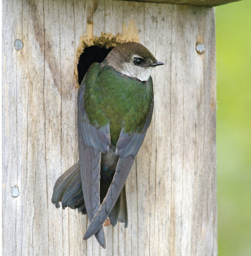
Figure 18. Violet-green Swallow at Thunder Bay, Thunder Bay on 14 June 2017.