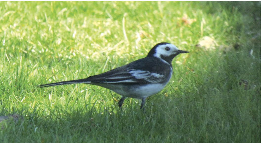
Figure 20. White Wagtail of the subspecies yarellii (“Pied Wagtail”) at Port Colborne, Niagara on 16 April 2017.

2017 – one, first basic male, 29 November-19 December, Oakville, Halton (Cheryl E. Edgecombe, Dominik Halas; 2017-007) – photos on file.