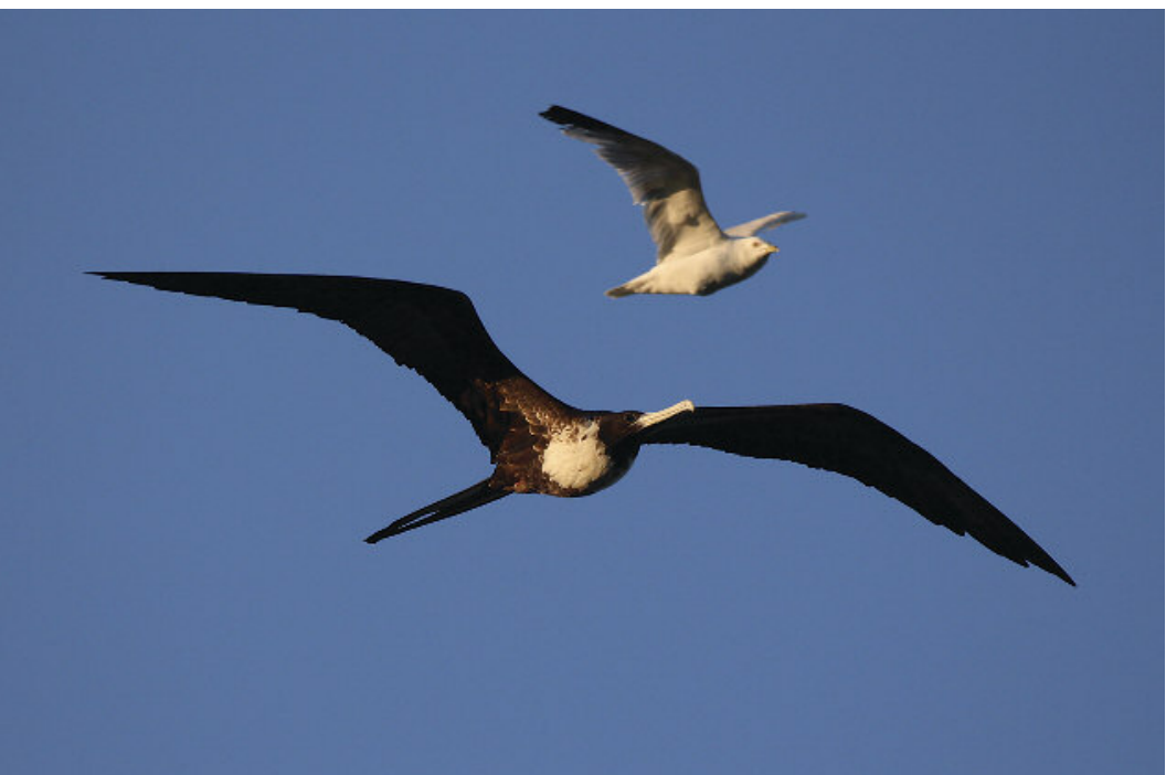
Figure 6. Magnificent Frigatebird at Sturgeon Creek (mouth), Essex on 2 July 2017.