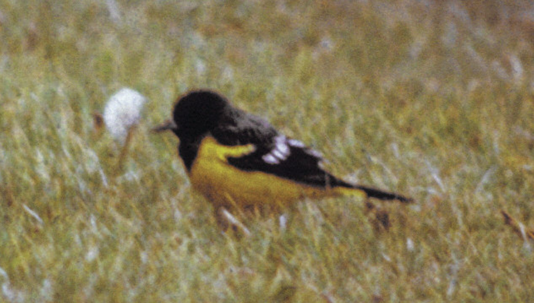
Figure 23. Scott's Oriole at Silver Islet, Thunder Bay on 9 November 1975.