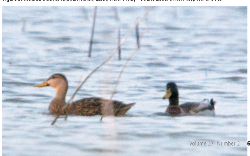
Figure 3: Mottled Duck at Hillman Marsh, Essex, from 1 May - 6 June 2008.

The Committee considered the possibility that this individual, the first for the province, came from one of the established, introduced populations, such as the east coast (South Carolina) or Oklahoma. However, there was no evidence to suggest this to be the case. In addition, there is a well established pattern of vagrancy of birds from the species native range (Texas and the Gulf coast) into the mid- and upper Mississippi Valley (states such as lowa, Indiana, Illinois, Missouri and North Dakota). Furthermore, the introduced populations have been in place since the 1970s to early 1980s, so even if the bird was from these areas, it would still be considered a wild bird from an established population.