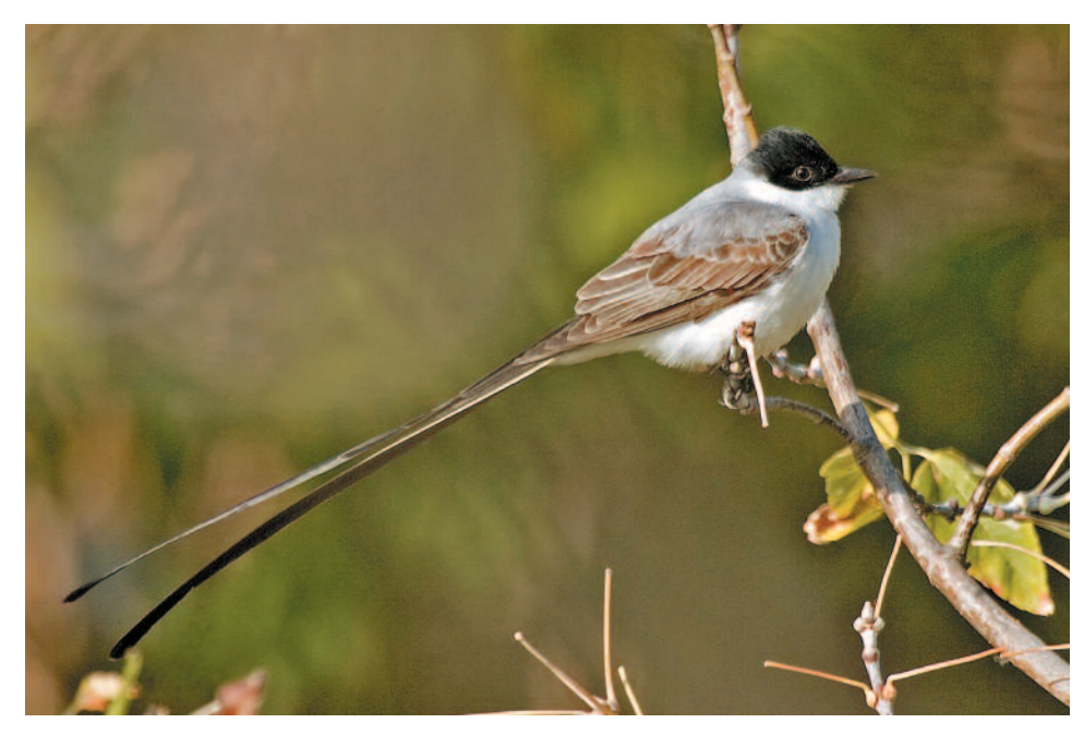
Figure 14: Fork-tailed Flycatcher north of Point Pelee National Park, Essex, on 22 October 2008.