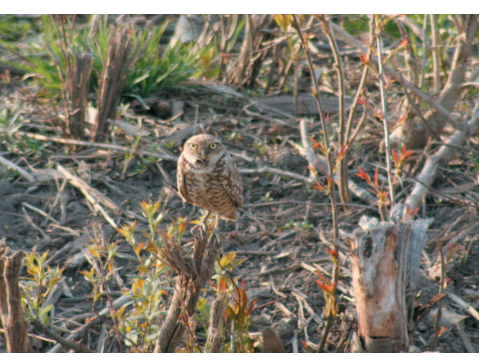
Figure 12: Burrowing Owl, at Pelee Island, Essex, on 25 April 2008.