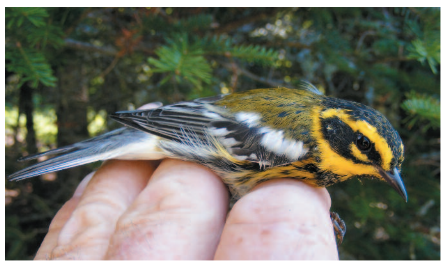
Figure 16: Definitive alternate male Townsend's Warbler at Thunder Cape, Thunder Bay, on 3 August 2008.

Two birds were present at the same time at Point Pelee National Park in May 2005. Numerous photographs were obtained of the two, but for the majority of photos, the Committee was unable to assign them to a specific individual; thus one of the birds remains undocumented