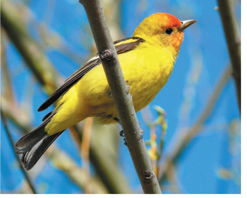
Figure 17: Alternate male Western Tanager at Sault Ste. Marie, Algoma, from 7-8 May 2008.