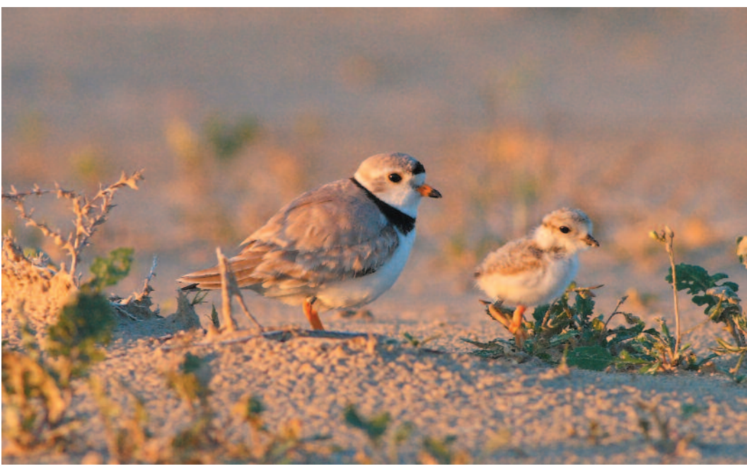
Figure 9: Definitive alternate Piping Plover at Oliphant, Bruce, from 5 June - 21 July 2008.