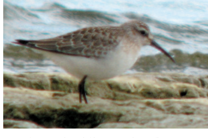
Figure 10: Curlew Sandpiper in juvenal plumage at Fort Erie, Niagara, from 28 September – 14 October 2008.