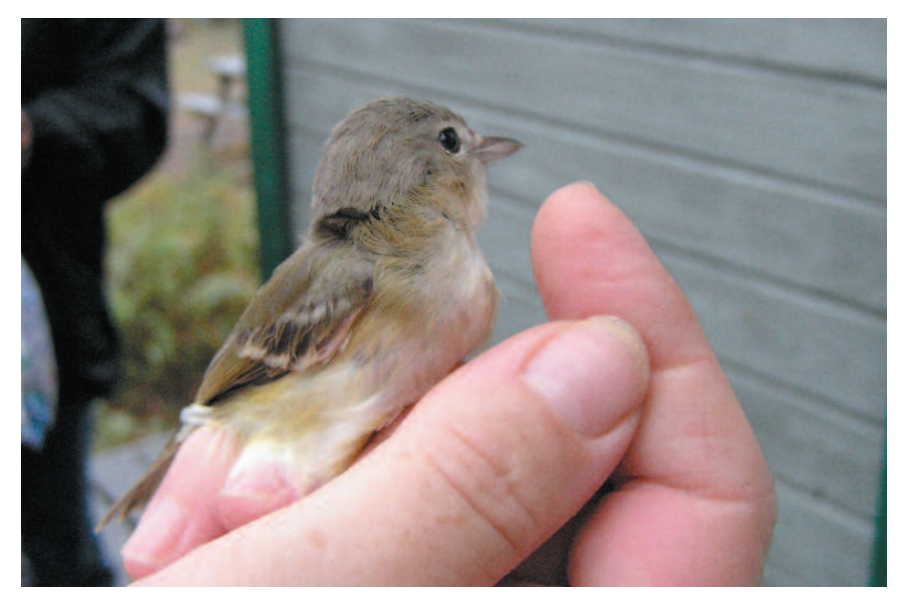
Figure 15: First basic Bell's Vireo, at Thunder Cape, Thunder Bay , on 7 September 2007.

A second bird joined the Parry Sound bird in January 2009, also remaining until late March.