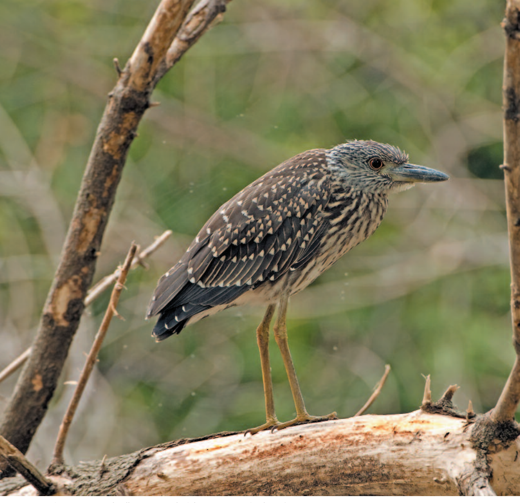
Figure 6: Juvenal Yellow-crowned Night-Heron at Grimsby, Niagara , on 24 August 2008.