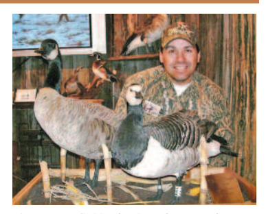
Figure 2: Definitive basic male Barnacle Goose, Baie Des Atocas, Prescott and Russell, circa 20 November 2005.

2005 - one, definitive basic, male, circa 20 November, Baie Des Atocas, Prescott and Russell (Jean Buswell, also found by Henri Poupart, Jean-Claude Bermond; 2008-051) - photo on file; specimen (mount) in private collection of Jean Buswell.