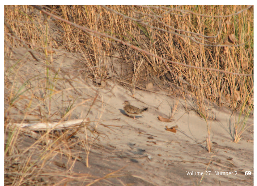
Figure 11: Juvenile Common Ground-Dove at Long Point (Squires Ridge), Norfolk , on 1 November 2008.

This record is only the third for the province, and the first for the south. The two previous records were on 29 October 1968 at Red Rock, Thunder Bay (Wormington 1987) and 14 August 2002 at Thunder Cape, Thunder Bay (Crins 2003).