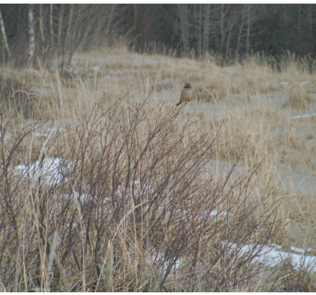
Figure 13: Say's Phoebe at Terrace Bay, Thunder Bay, on 28 April 2008.

This is the first record for northern Ontario, and represents the most northerly occurrence of the species in North America.