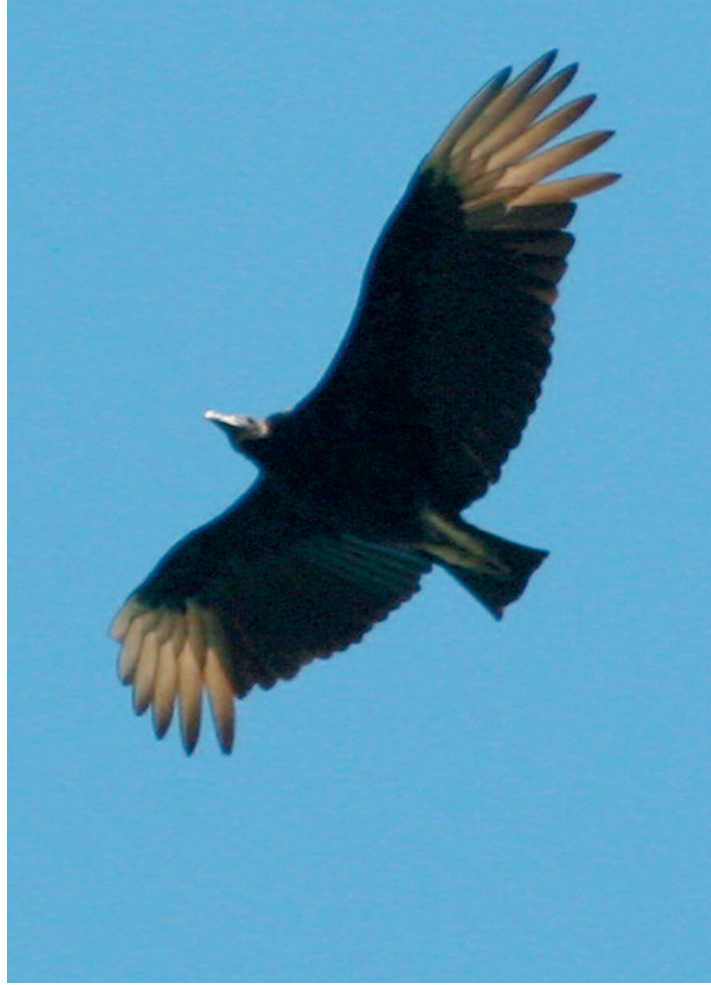
(right) Figure 7: Definitive basic Black Vulture on 22 June 2008 at Tobermory, Bruce.