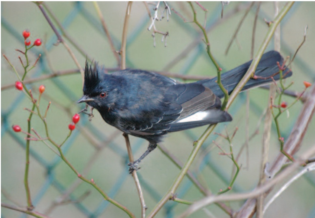
Figure 14: Male Phainopepla moulting into first basic plumage from 9 November 2009 to 9 February 2010 at Brampton, Peel.