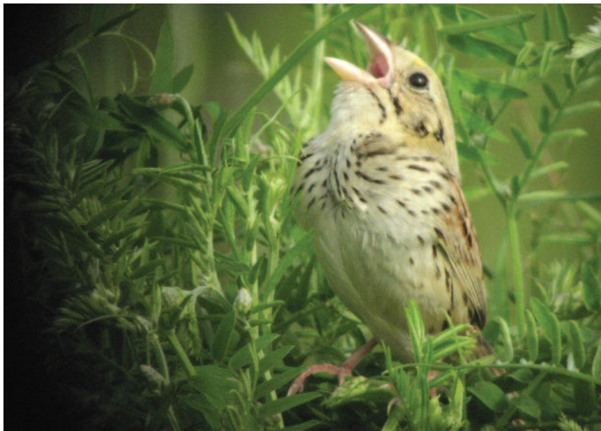
Figure 19: Alternate male Henslow's Sparrow from 27-29 July 2009 at Paskwachi Point, Cochrane .