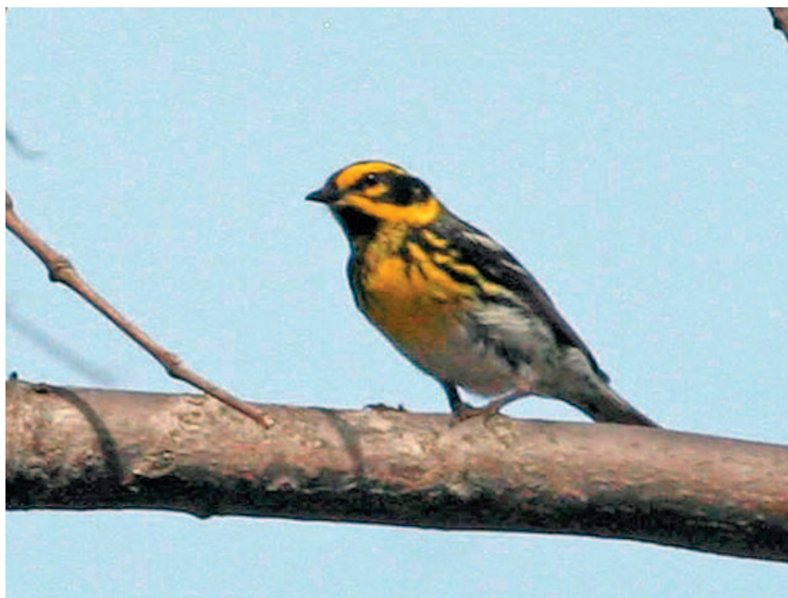
Figure 16: Townsend's Warbler at Rondeau Provincial Park, Chatham-Kent, on 8 May 2009.