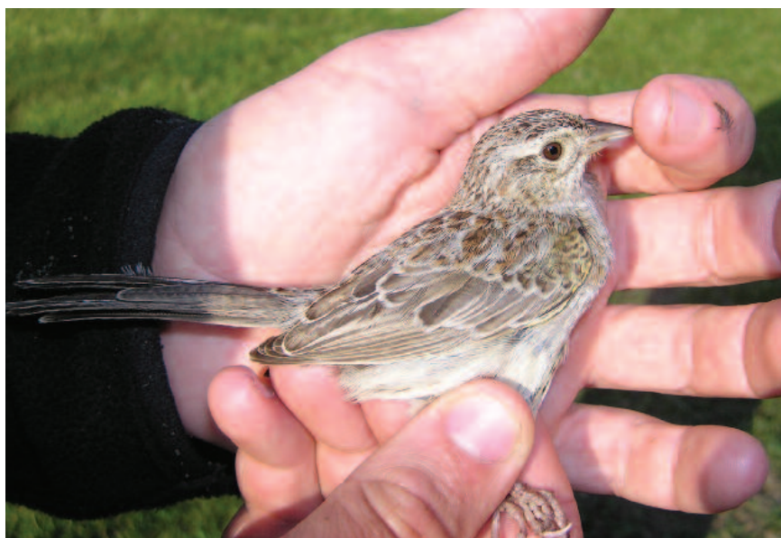
Figure 17: Cassin's Sparrow at Long Point (Tip), Norfolk, on 30 May 2007.