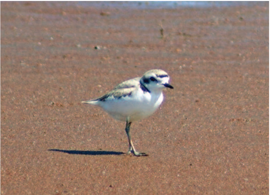
Figure 7: Snowy Plover at Wolf River mouth, Thunder Bay , 22-23 May 2009.