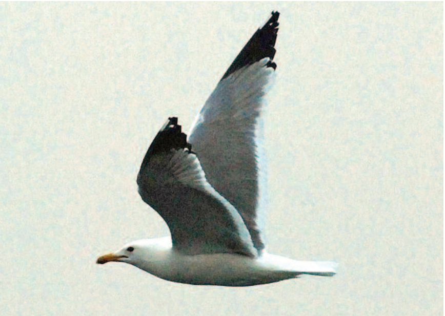
Figure 9: Third alternate or definitive alternate California Gull, on 9 May 2009, at Point Pelee National Park, Essex .