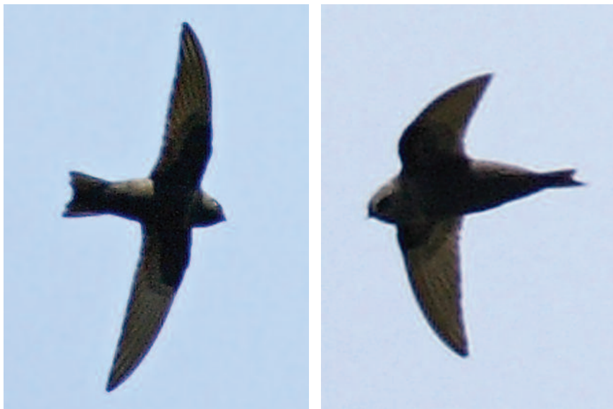
Figure 11: Male Black Swift at Point Pelee National Park, Essex , on 17-18 May 2009.