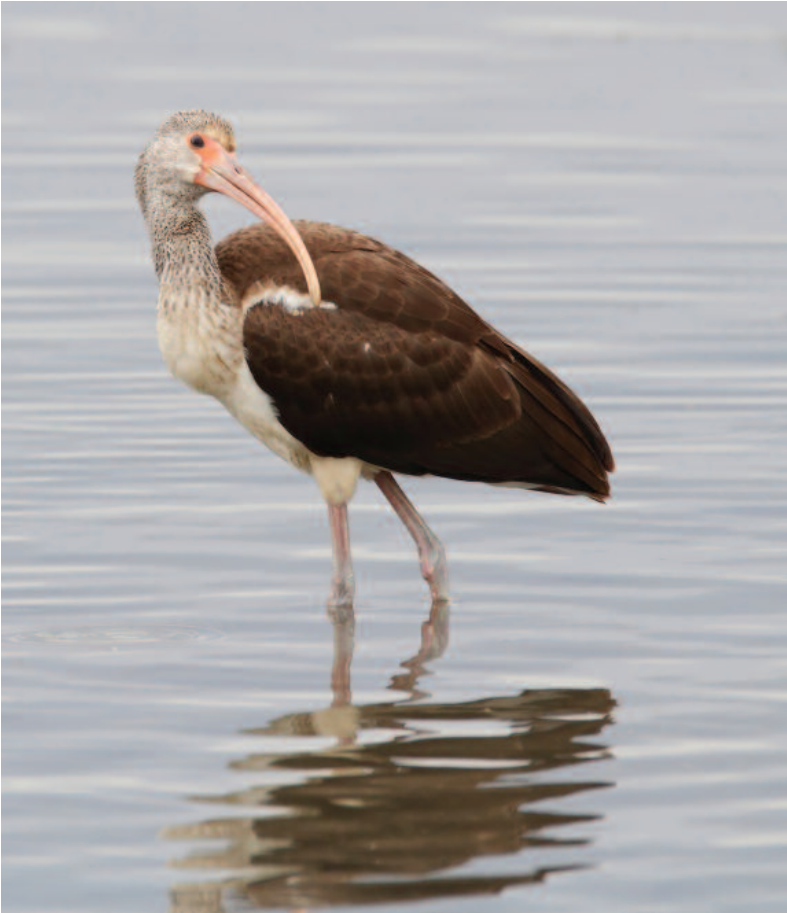
Figure 4: Juvenal White Ibis at Whitby Harbour, Durham, on 3 October 2009.