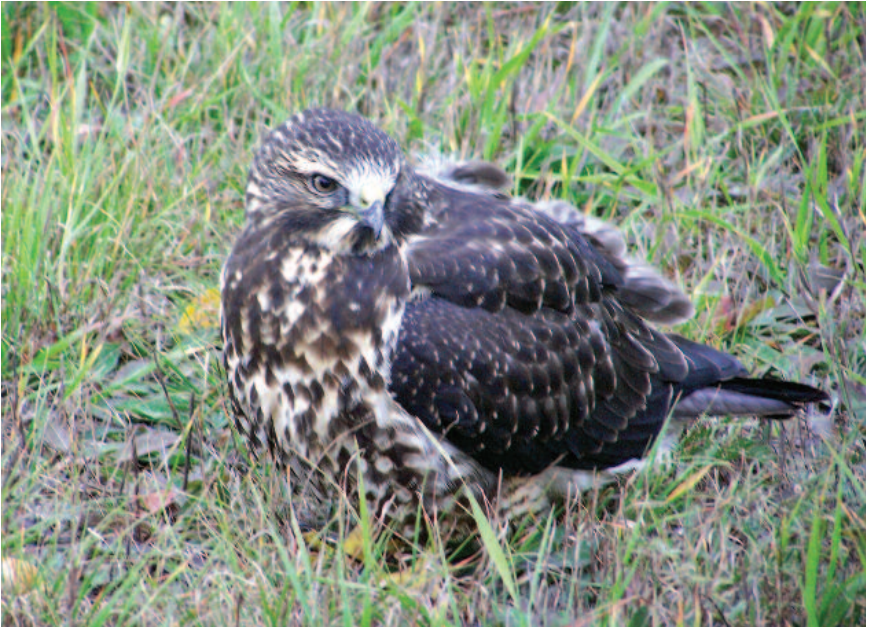
Figure 6: Juvenal intermediate morph Swainson's Hawk at Thunder Bay, Thunder Bay , on 28 September 2009.