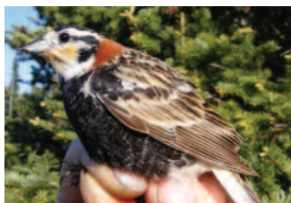
right: Figure 21: Definitive alternate male Chestnut-collared Longspur at Thunder Cape, Thunder Bay , on 30 May 2009.