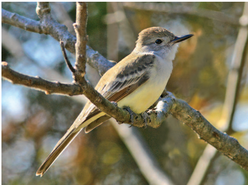
Figure 12: Ash-throated Flycatcher in first basic plumage at Point Pelee National Park, Essex , on 6 November 2009.