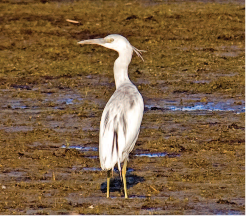
Figure 3: Little Blue Heron at Kingston, Frontenac , on 13 May 2009.