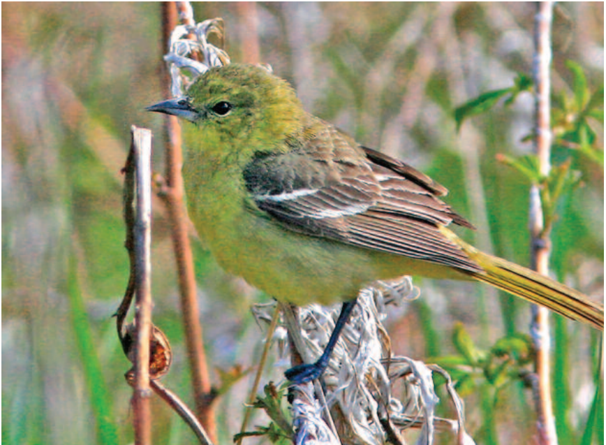
Figure 25: Female Orchard Oriole at Terrace Bay, Thunder Bay , on 29 May 2009.