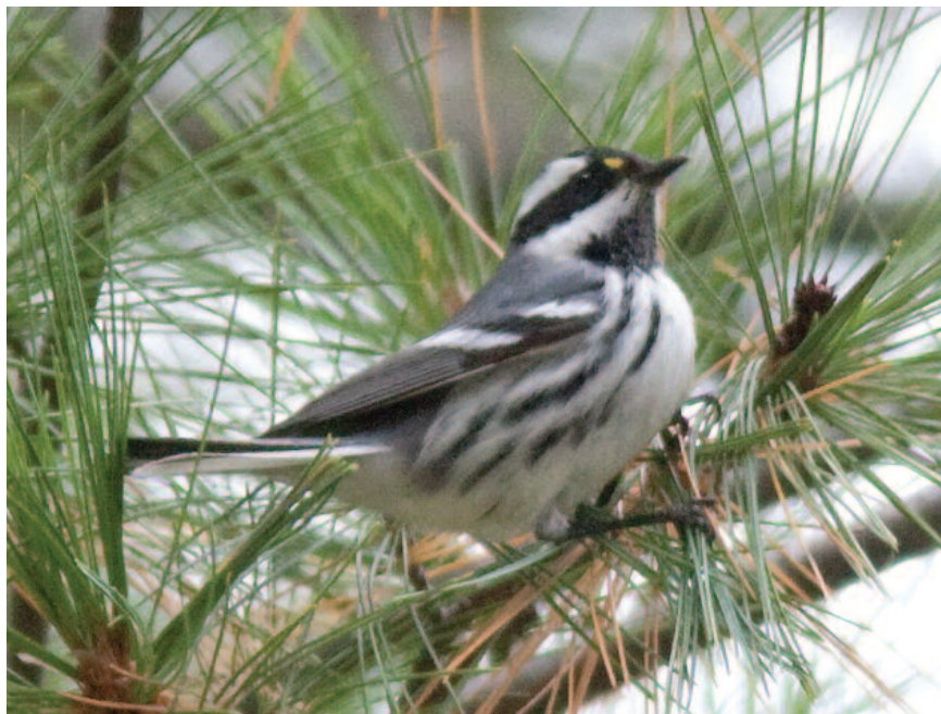
Figure 15: Black-throated Gray Warbler at Port Ryerse, Norfolk , from 11-12 October 2009.