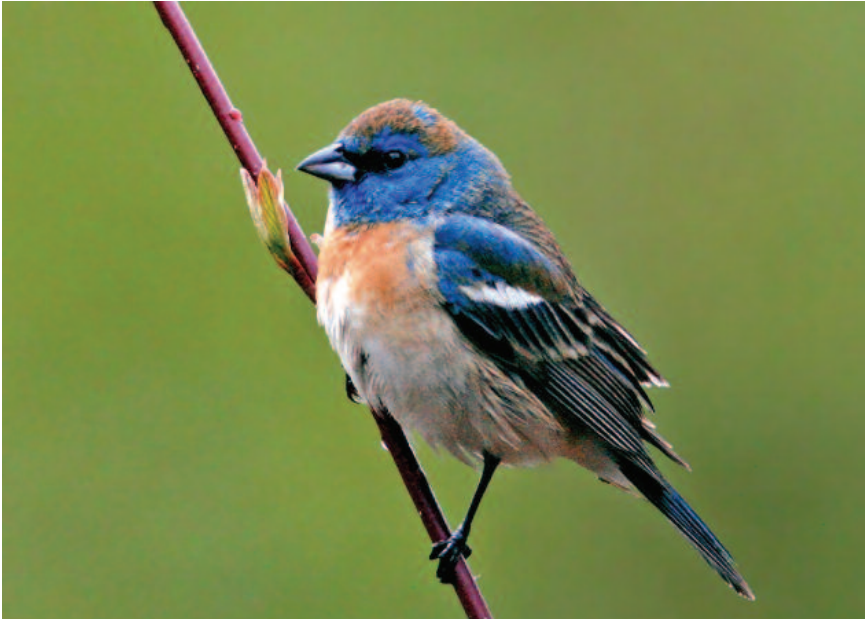
Figure 24: First alternate male Lazuli Bunting at Crooks, Thunder Bay , from 31 May to 3 June 2009.