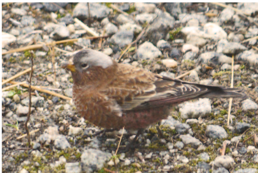
Figure 27: Basic Gray-crowned Rosy-Finch (n nominate tephrocotis ) at Moonbeam, Cochrane , on 20 November 2009.