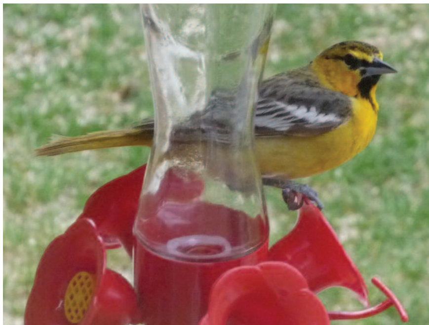
Figure 26: First alternate male Bullock's Oriole at Armstrong, Thunder Bay , from 1-10 June 2009.