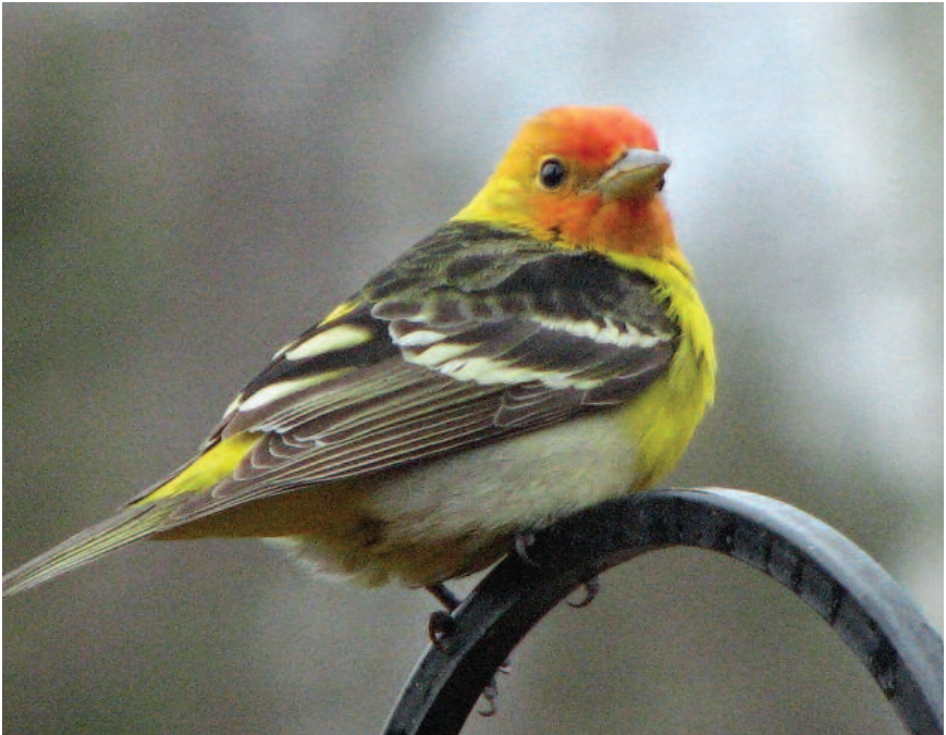
Figure 22: Western Tanager at Pass Lake, Thunder Bay , 27 April to 6 May 2008.