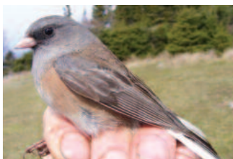
left: Figure 20: First basic female "Pink-sided" Dark-eyed Junco at Thunder Cape, Thunder Bay , on 12 May 2009.