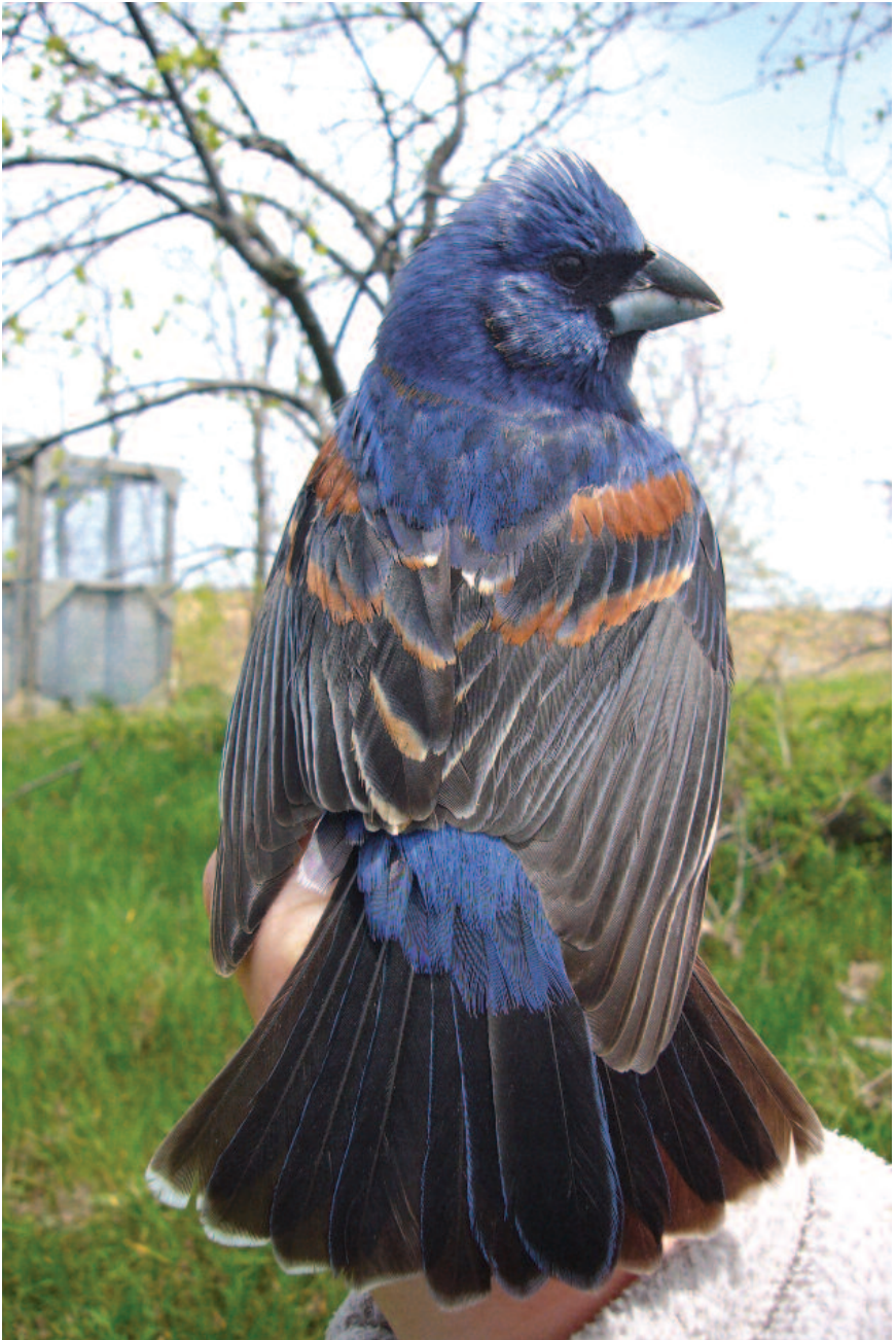
Figure 23: Definitive alternate male Blue Grosbeak at Long Point (Courtright Ridge), Norfolk, on 16 May 2008.