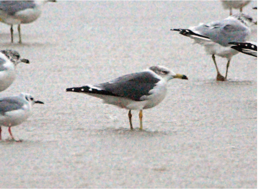
Figure 8: Definitive basic Black-tailed Gull, 28 September 2009, Port Burwell, Elgin .