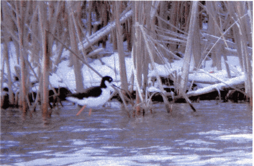
Figure 6: This definitive basic, female Black-necked Stilt, a very late lingering fall vagrant, was observed from 27 December 2001 to 2 January 2002 at Port Lambton, Lambton .