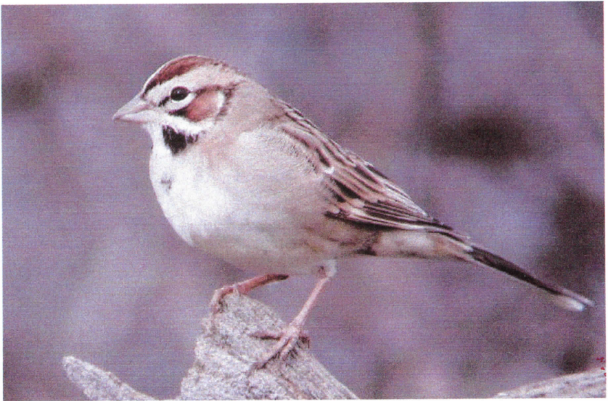
Figure 12: For the period 24 November to 22 December 2001, this basic Lark Sparrow was observed at Newburgh, Lennox and Addington .