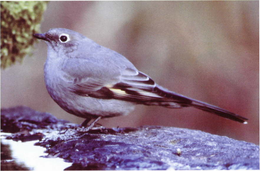
Figure 10: Townsend's Solitaire, observed at Copetown, Hamilton , 11 November 2001.