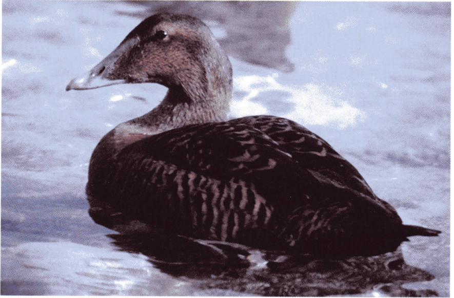
Figure 4: First basic, female Common Eider ( S. m. dresseri ) at Burlington, Halton , on 17 January 2001.