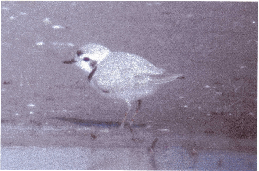
Figure 5: Definitive alternate Snowy Plover located at Presqu'île Provincial Park, Northumberland , 27 May 2001.