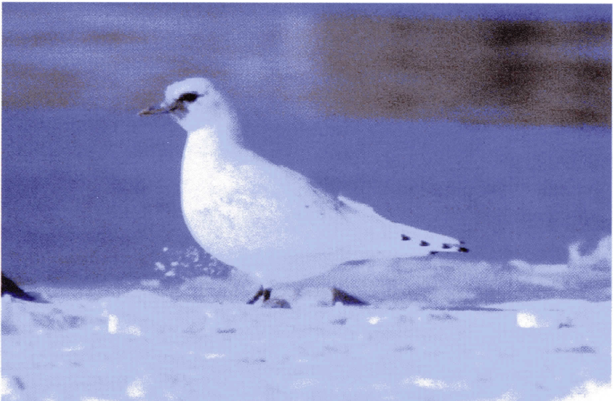
Figure 7: Ivory Gull, juvenal/first basic, at Humber Bay Park, Toronto , on 23 December 2000.