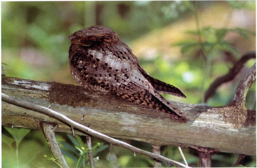
Figure 9: This basic, female Chuck-will's-widow, was located at Point Pelee National Park, Essex , on 13 May 2001.