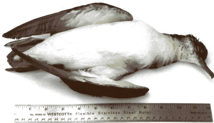
Figure 1: A first record for Ontario, this female Manx Shearwater was found dead, floating in the waters of Lake Deschenes, Ottawa River, Ottawa, on 9 September 2002.

I am indebted to the 1999, 2000, and 2001 OBRC members for their very considerable help and assistance over the years. Your confidence and support were very much appreciated.