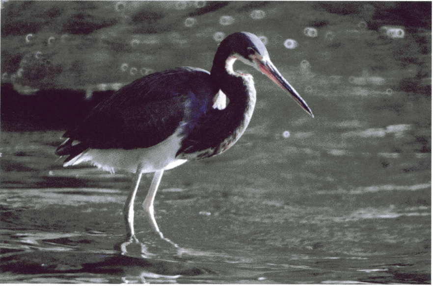
Figure 2: First alternate Tricolored Heron, found at Port Weller, Niagara , on 30 May 2001.