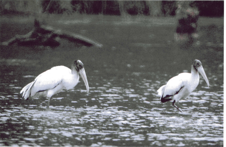
Figure 3: Two of three juvenal Wood Storks observed at Pelee Island, Essex , from 9 August to 22 September 2001.