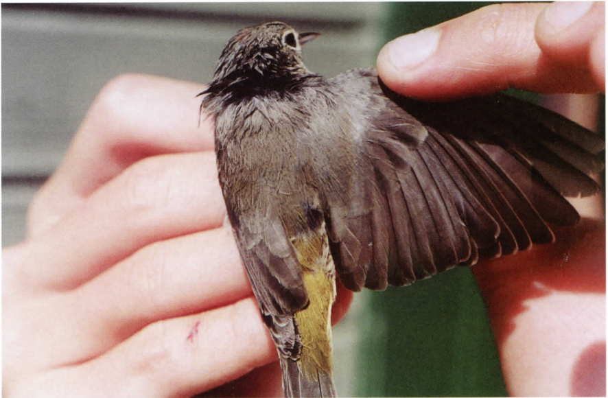
Figure 11: This first basic, male Virginia's Warbler was captured and banded at Thunder Cape, Thunder Bay , on 29 August 2001.