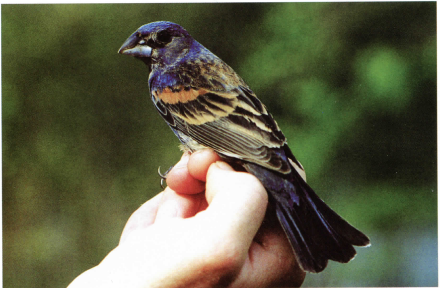
Figure 13: This first alternate, male Blue Grosbeak was captured and banded at Walsingham, Norfolk , on 15 May 2001.