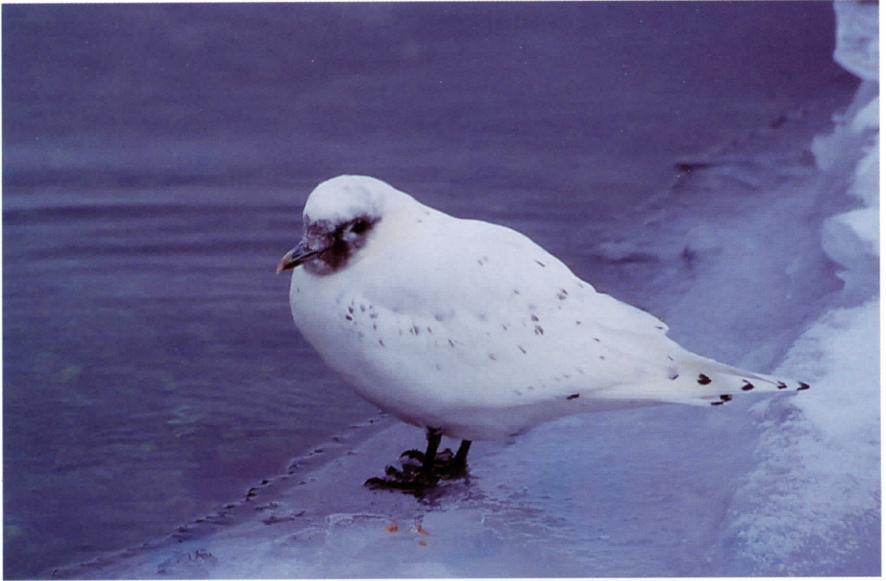
Figure 8: Ivory Gull, juvenal/first basic, at Amherst Island, Lennox and Addington , on 9 January 2001.