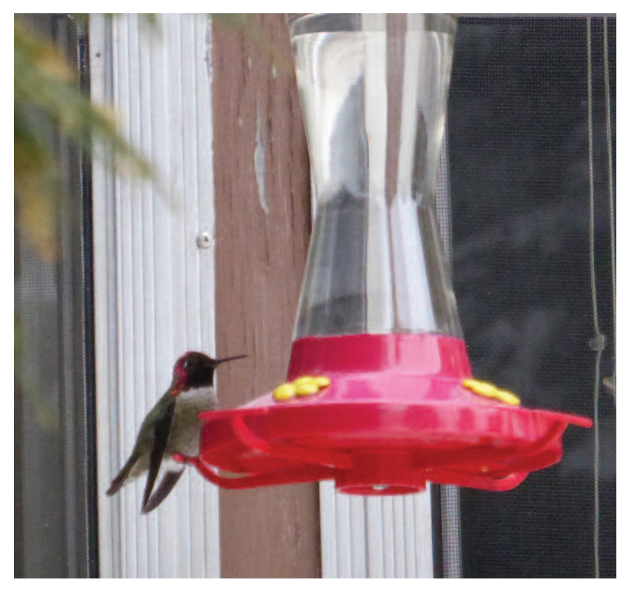
Figure 10: Anna's Hummingbird, Thunder Bay, Thunder Bay on 3 December 2013.