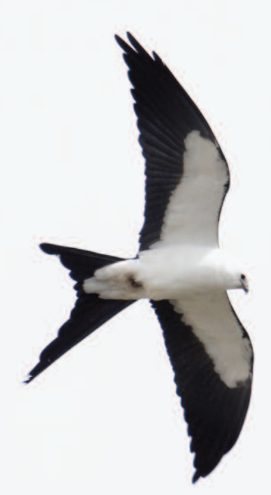
Figure 6: Swallow-tailed Kite, Port Alma, Chatham-Kent on 4 May 2013.