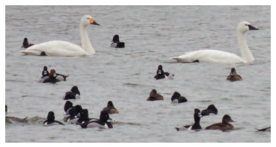
Figure 2: "Bewick's" Tundra Swan (left) with "Whistling" Tundra Swan (right), Ridgetown, Chatham-Kent on 15 March 2013.