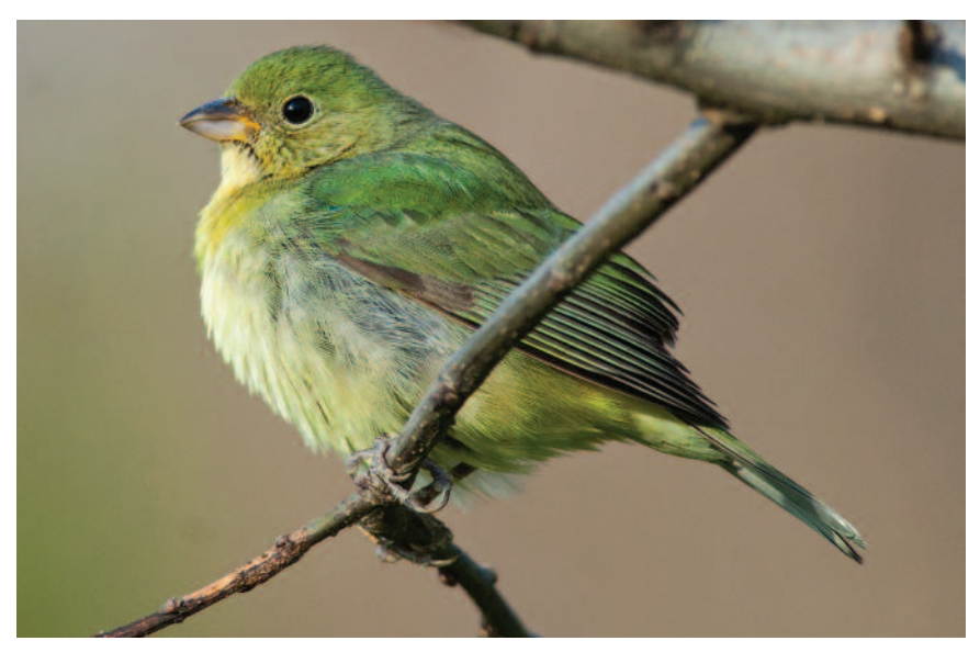
Figure 17: Painted Bunting, Sturgeon Creek, Essex on 29 April 2013.