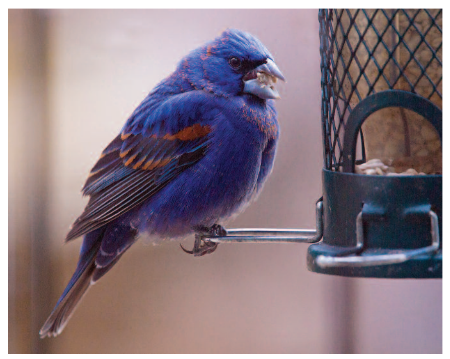
Figure 16: Blue Grosbeak, Windsor, Essex on 20 April 2013.