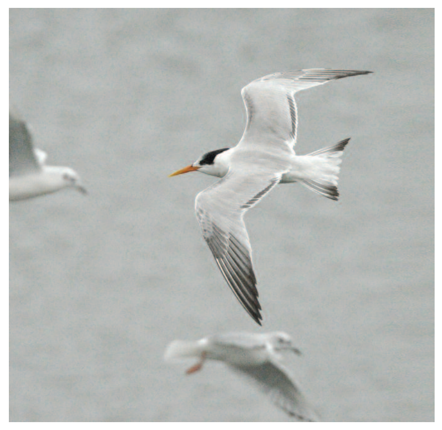
Figure 9: Elegant Tern, Buffalo, New York, on 21 November 2013. This same individual provided the first Ontario record when it crossed the river into Canadian waters.