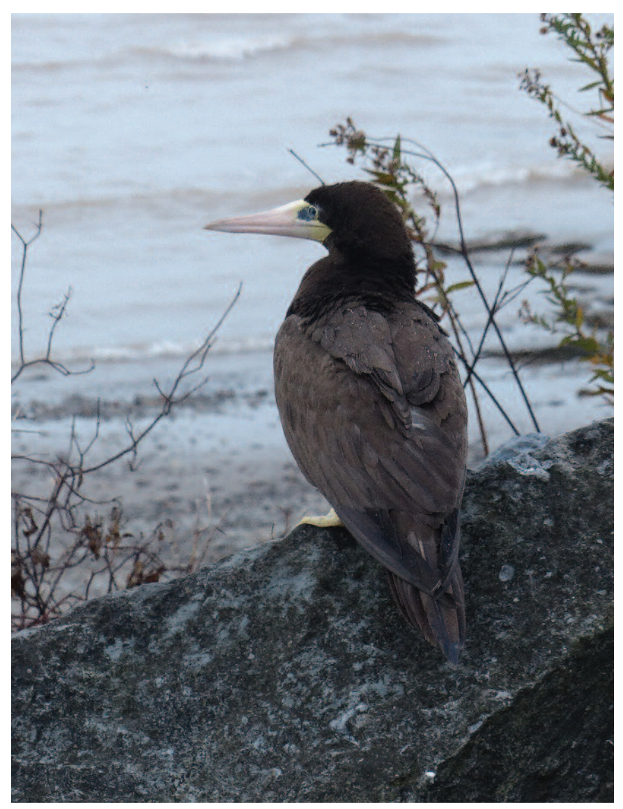
Figure 3: Brown Booby, Lowbanks, Haldimand on 2 November 2013.