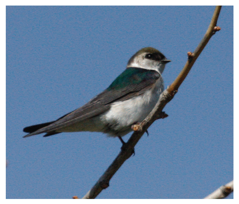
Figure 13: Violet-green Swallow, Britannia, Ottawa on 25 April 2013.

This is the first record for southern Ontario. The first provincial record was at Thunder Cape, Thunder Bay on 28-29 October 1992 (Bain 1993)