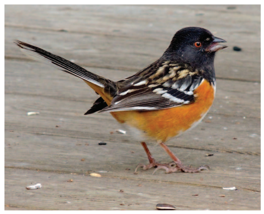
Figure 14: Spotted Towhee, Glenn Williams, Halton on 18 January 2014.