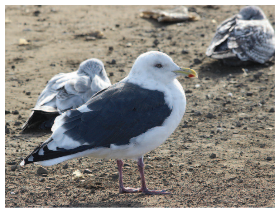
Figure 8: Slaty-backed Gull, Thunder Bay, Thunder Bay on 8 November 2013.