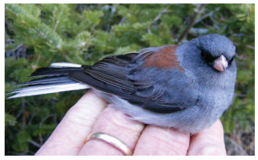
Figure 15: "Gray-headed" Dark-eyed Junco, Thunder Cape, Thunder Bay on 15 May 2013.