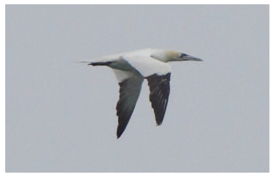
Figure 4: Northern Gannet, Stoney Creek, Hamilton on 1 September 2013.