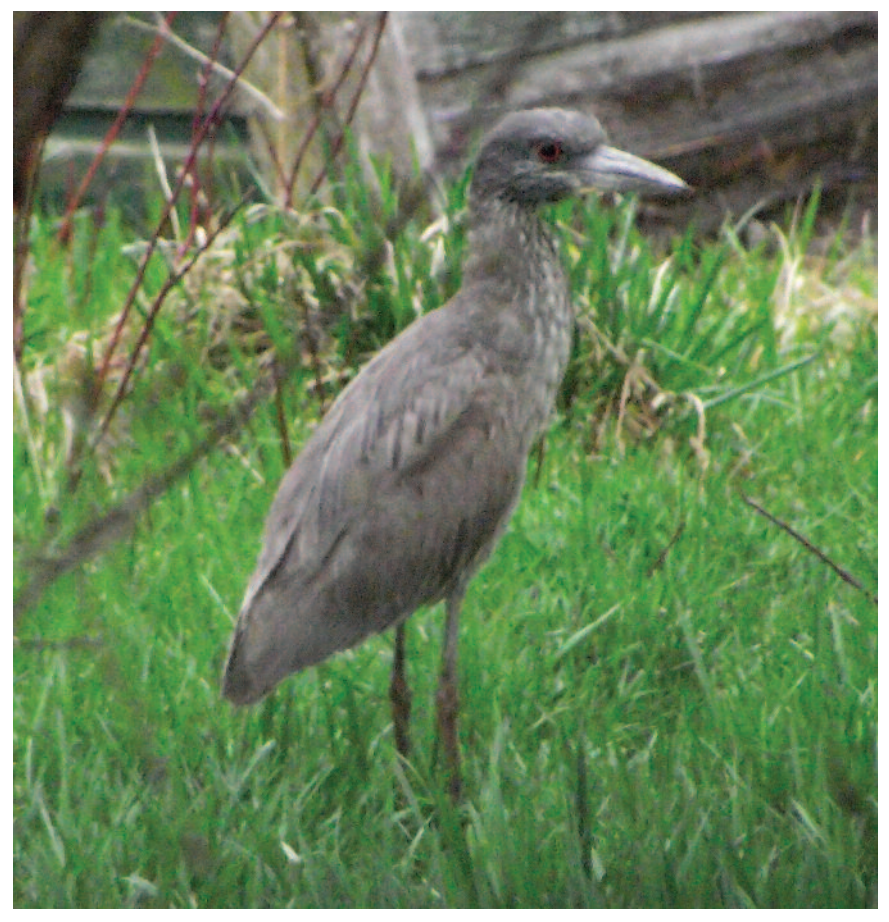
Figure 5: Yellow-crowned Night-Heron, Lindsay, Kawartha Lakes on 30 April 2013.