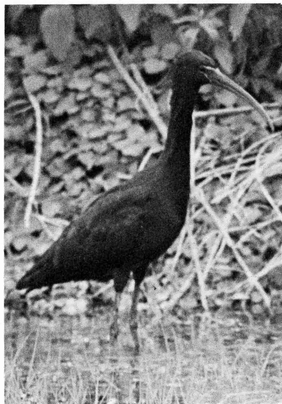
Glossy Ibis , 1-16 May 1976, Point Pelee National Park, Essex Co.