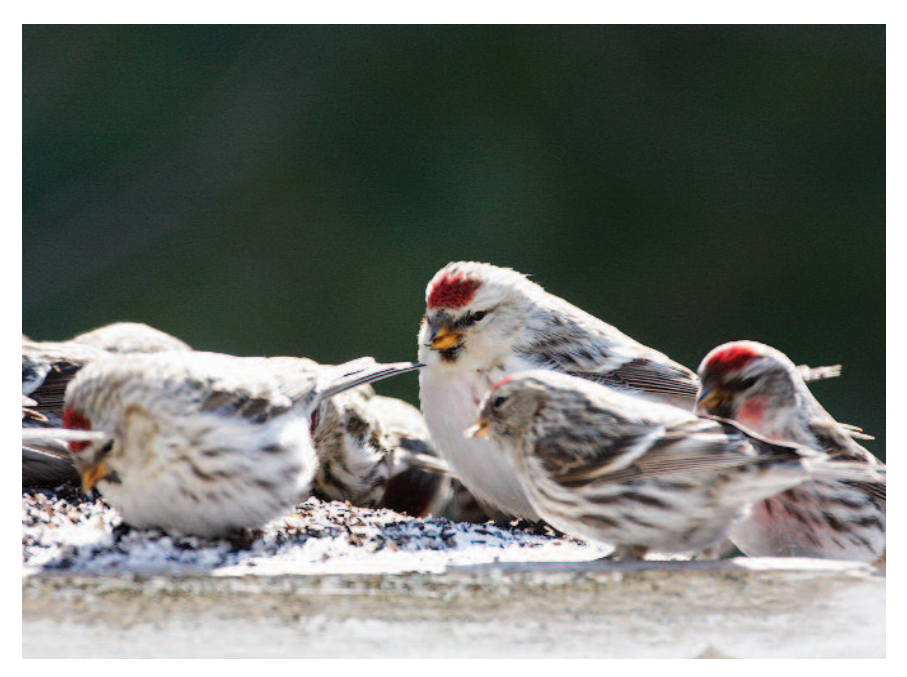
Figure 17: "Hornemann's" Hoary Redpoll at Bala, Muskoka on 11 March 2009.