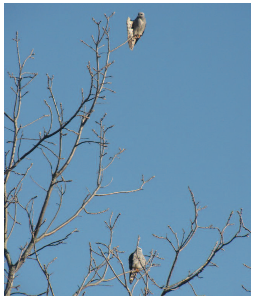
Figure 6: Mississippi Kites at Simcoe, Norfolk on 11 May 2014.