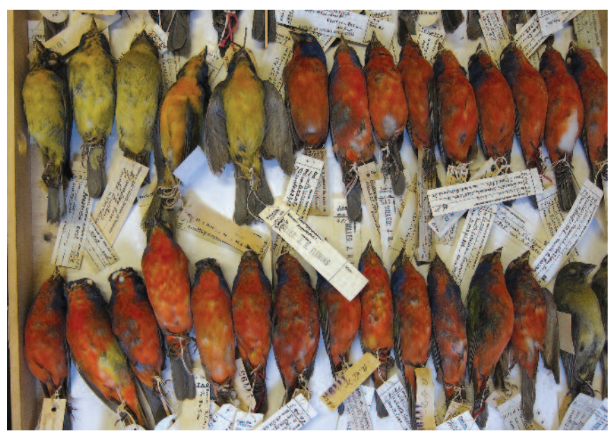
Figure 20: Specimen tray of adult male Painted Buntings at the ROM; the five specimens showing yellow-orange underparts in the top-left are noted as being held in captivity before death.