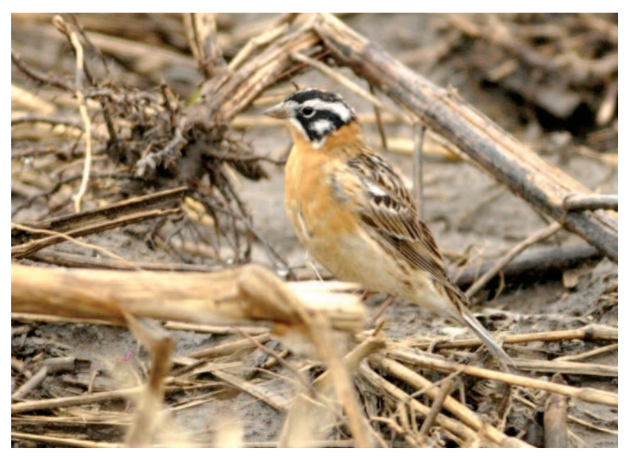
Figure 13: Smith's Longspur at Elmdale, Essex on 29 April 2014.