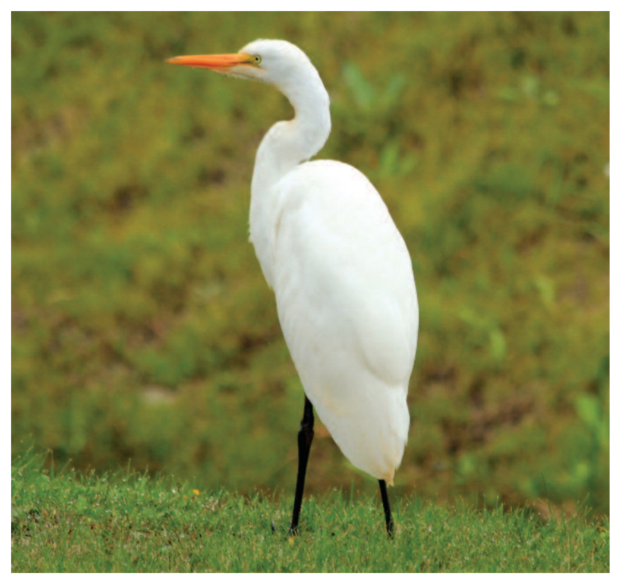
Figure 3: Great Egret at Thunder Bay, Thunder Bay on 3 September 2014.