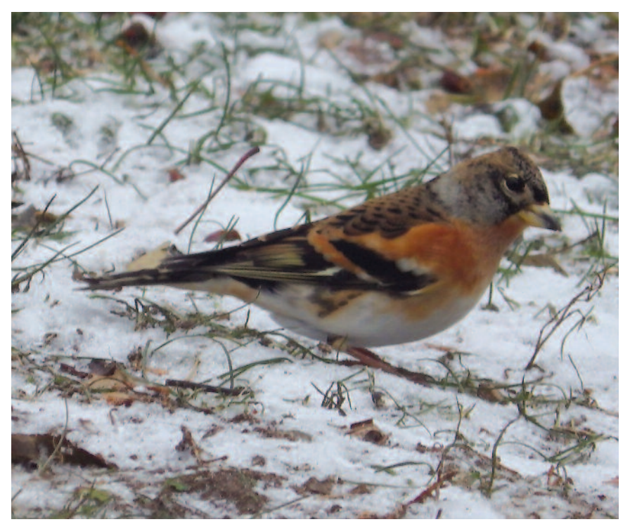
Figure 16: Brambling at North Bay, Nipissing on 26 November 2014.

The timing of this record fits with an influx of Brambling in mid-November in North America with other sightings in Wyoming, California, Washington, and British Columbia (eBird 2015).