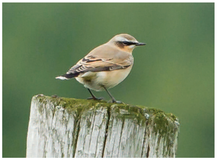
Figure 12: Northern Wheatear at Navan, Ottawa on 21 September 2014.