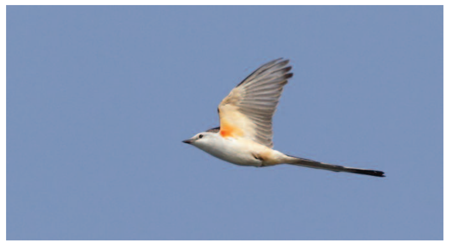
Figure 10: Scissor-tailed Flycatcher at Point Pelee National Park, Essex on 11 May 2014.