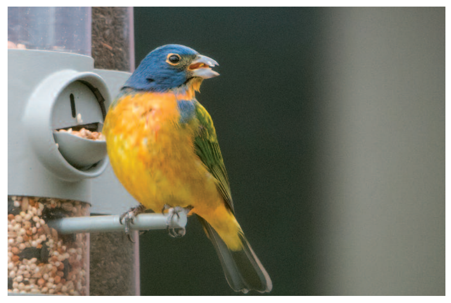
Figure 19: Painted Bunting at Oakville, Halton showing damaged bill and abnormal (yellow-orange) breast colour on 19 December 2014.