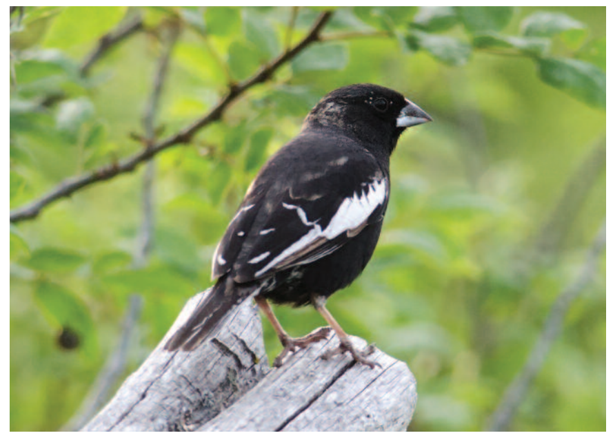
Figure 14: Lark Bunting at Amherst Island, Lennox and Addington on 23 June 2014.