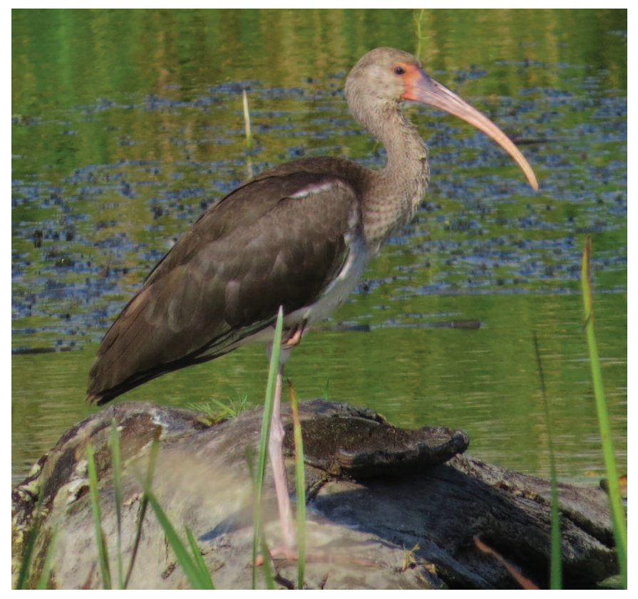
Figure 5: Juvenal White Ibis at Napanee, Lennox and Addington on 26 August 2014.