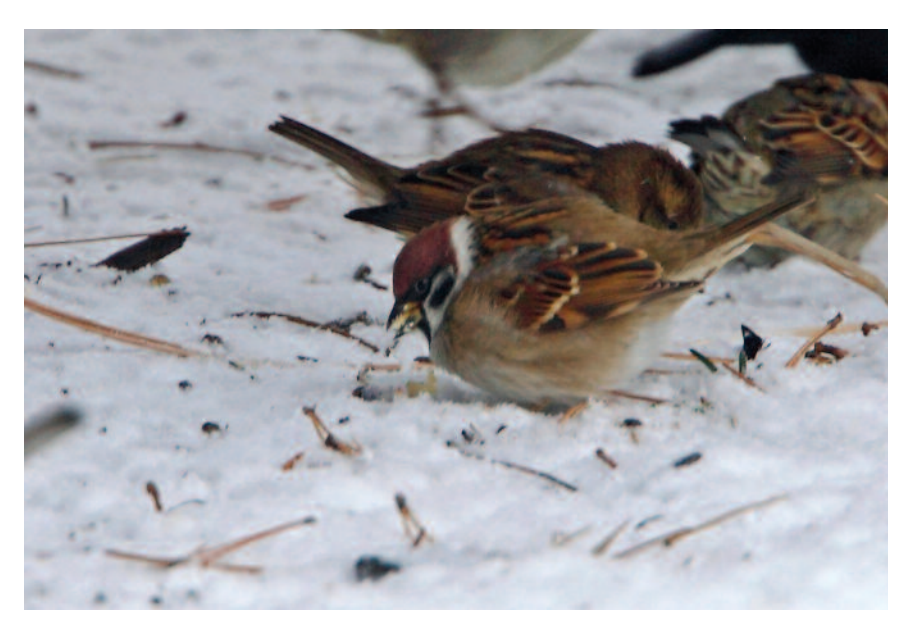
Figure 18: Eurasian Tree Sparrow at Niagara-on-the-Lake, Niagara on 28 November 2014.