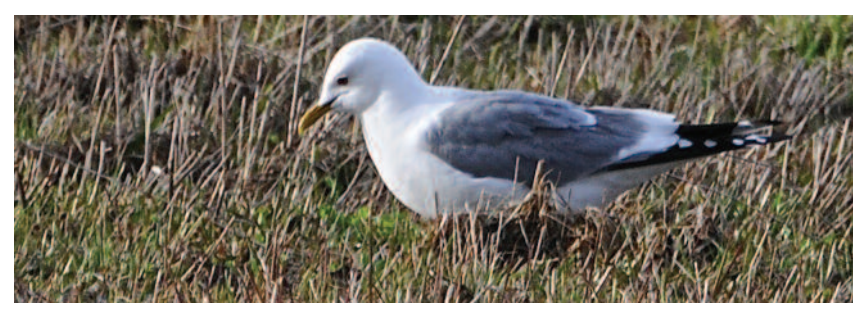
Figure 7: Mew Gull (brachyrhynchus) at Pass Lake, Thunder Bay on 13 May 2014.