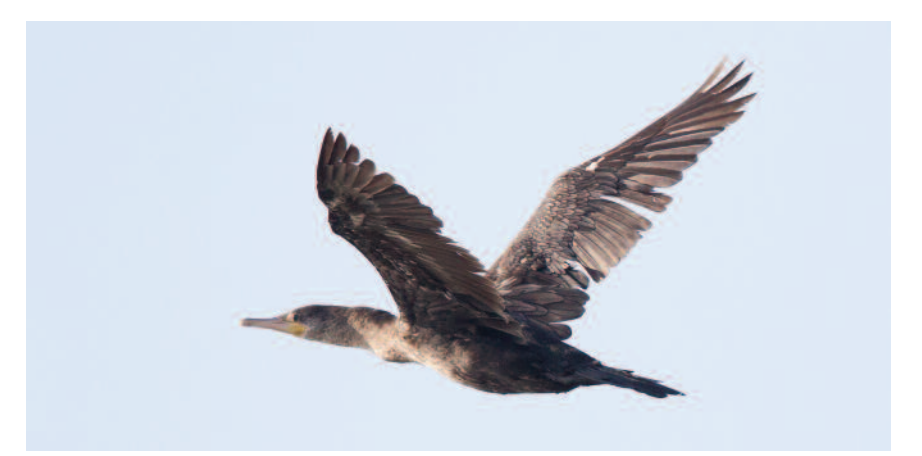
Figure 2: Neotropic Cormorant at Point Pelee National Park, Essex on 13 May 2014.