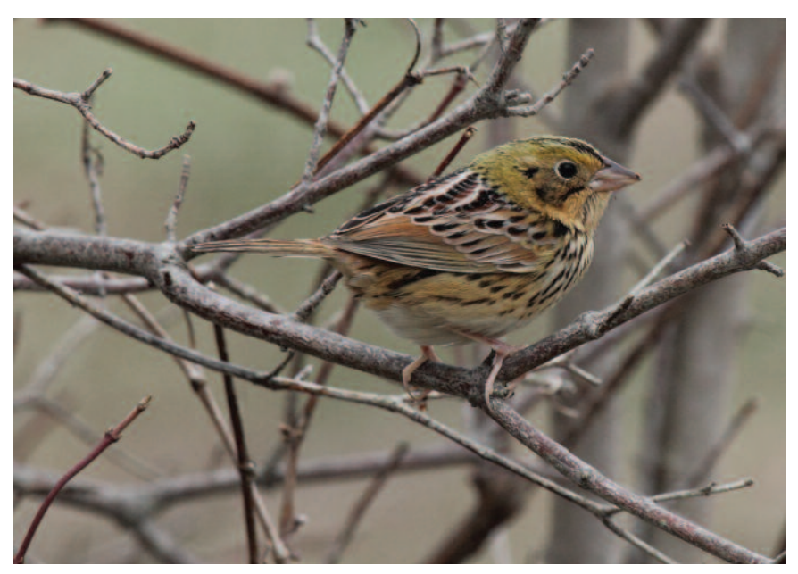
Figure 15: Henslow's Sparrow at Point Pelee National Park, Essex on 18 April 2014.