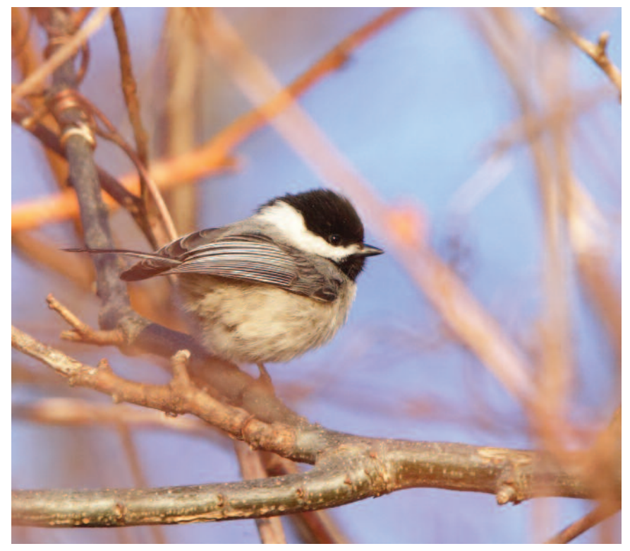
Figure 11: Carolina Chickadee at Point Pelee National Park, Essex on 13 May 2013.