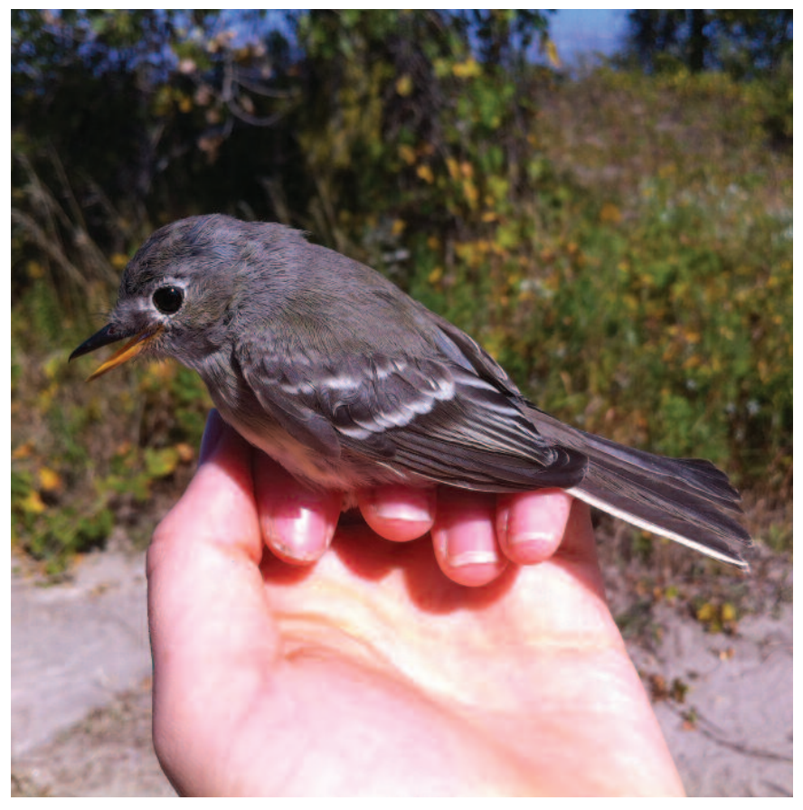
Figure 8: Gray Flycatcher at Long Point (Tip), Norfolk on 29 September 2014.