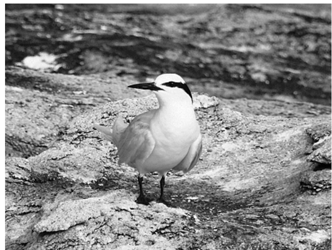
Fig. 2. The Black-naped Tern, one of the most abundant breeding tern species along the east coast islands of Peninsular Malaysia.

The Bridled Tern is a resident breeder of the study area (Jeyarajasingam & Pearson 2012) and tends to occupy oceanic environments and isolated islands with cliffs and moderate vegetation cover (Hamza et al. 2016a, 2016b). It breeds from May to August, laying one to two eggs on bare rocks, in cliff crevices,