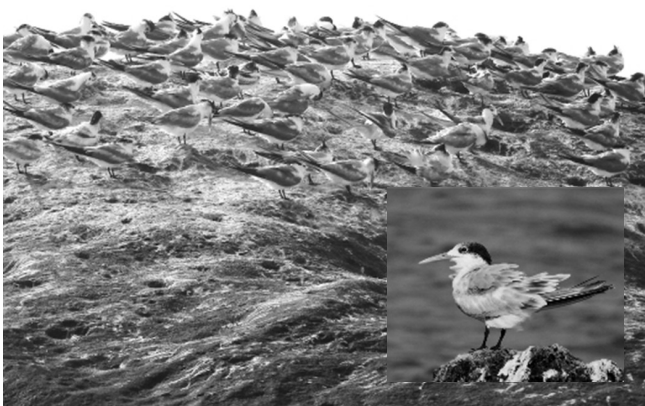
Fig. 4. Aggregation of roosting adult and juvenile Greater Crested Tern on Pulau Labas.