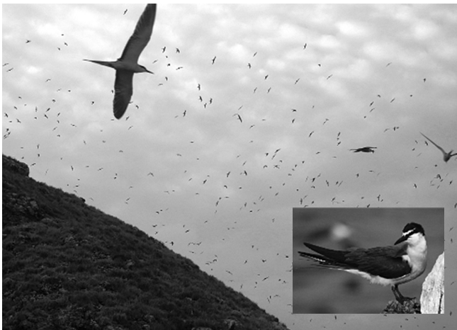
Fig. 3. The Bridled Tern colony at Tokong Burung. These three islands host one of the largest colonies of this species in southeast Asia.

The Lesser Frigatebird, a large seabird, is a wintering migrant of the study area, breeding mainly at Christmas Island in the Indian Ocean south of Java (Jeyarajasingam & Pearson 2012). This species was observed during all three trips of this survey. The literature refers to Pulau Ringgis (close to Tioman's southwest coast) as a major roosting site for this species in Malaysia; however, during the present study, all encounters with this species were either on open