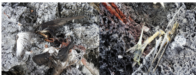
Fig. 6. (A) The remains of Bridled Terns and (B) fish, likely eaten by a White-bellied Sea Eagle at Pulau Tokong Burung Besar.

This study presents the first update on seabirds, their colonies, and aggregation sites in the northern section of the Seribuat Archipelago since the historic surveys conducted nearly 70 years ago (Gibson-Hill 1950). Several sites were found to be important hotspots of seabird biodiversity in the region, both in terms of species richness and abundance. Some of these islands are of regional importance as seabird breeding sites (i.e., the Tokong Burung Group) and should be proposed as new Important Bird Areas (IBAs). Surrounding waters should be designated as Marine Protected Areas, which can