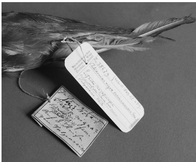
Fig. 1. Specimen label of the Black Tern collected by the Novara expedition in Chile (NMW 38679).