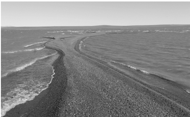
Fig. 2. The breeding island in Krusenstern Lagoon taken from the south end of the island on 13 September 2016 (Photo Trevor B. Haynes).

Because they have a longer breeding period than other tern species (Cuthbert & Wires 1999), Caspian Terns are likely one of these lower-latitude species that requires a long period of temperate, snow- and ice-free conditions during the breeding season to be successful in the Arctic. With the Caspian Tern’s incubation period of 25–28 d and pre-fledging period of 53–59 d, it takes Caspian Terns 78–87 d to fledge two chicks. By contrast, Arctic Terns Sterna paradisaea and Aleutian Terns Onychoprion aleuticus , which breed in the Arctic, including close to Krusenstern Lagoon, can fledge two chicks in 52–58 d and 54–64 d, respectively (Hatch 2002, North 2013). Even with this shorter breeding duration, during cold springs with high sea-ice cover, Arctic Terns that are restricted to using marine waters may have to delay breeding (Evans & McNicholl 1972) or to restrict breeding to certain locations (Lack 1933, Bird & Bird 1940). Thus, the length of the snow- and ice-free season in the Arctic represents a key constraint on the time available to complete all of the requisites of a successful breeding season (i.e., initiate a nest, lay, incubate and hatch eggs, and fledge chicks).