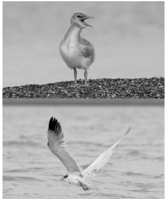
Fig. 3. Top, a flightless Caspian Tern chick on 23 July 2016; bottom, a volant Caspian Tern fledgling on 16 August 2016.

Alaska may have extensive barrier islands with available nesting habitat, although predation from Glaucous Gulls may be a factor that limits the breeding habitat of Caspian Terns (Gill 2008). Caspian Terns nested sympatrically with Glaucous Gulls at Cape Krusenstern Lagoon; however, tern adults could protect their nest from Glaucous Gulls by mobbing gulls when the colony was disturbed. Based on island area, the island used by the Caspian Terns for breeding may have the capacity to support more breeding pairs. However, it is unclear whether increased numbers of terns would displace the high densities of Glaucous Gulls, or whether gulls would be a source of breeding failure as the tern colony increases.