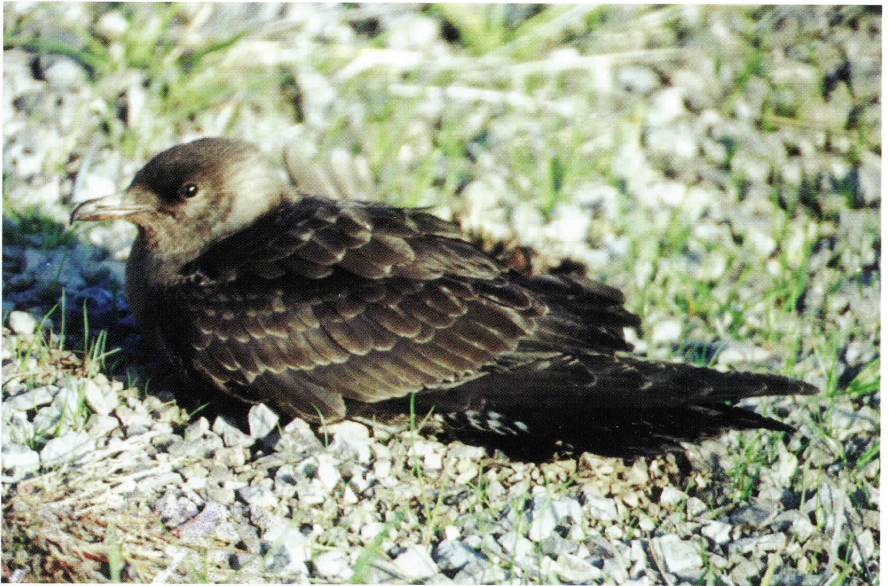
Figure 5: Juvenal Long-tailed Jaeger at Van Wagners Beach, Hamilton, Hamilton-Wentworth , on 28 October 1991.