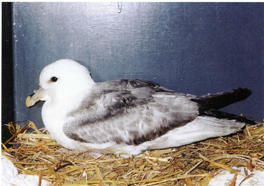
Figure 1: Female Northern Fulmar at Aurora, York, on 5 January 2000. This bird was found injured and incapable of flight, and was euthanized on 6 January 2000.

To the 2000 OBRC members, I thank you for your assistance and cooperation. Your continuing support is very much appreciated. To Rob Dobos, an extra thank you is extended for his valued advice.