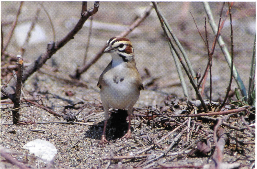
Figure 9: Alternate Lark Sparrow at Point Pelee National Park, Essex, on 17 May 2000.