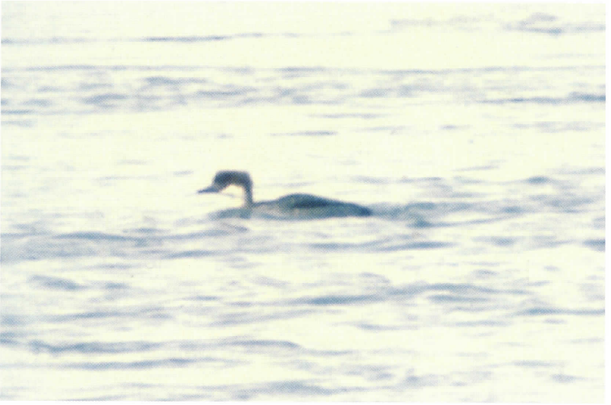
Figure 4: Female Smew on Niagara River at Miller's Creek, Niagara , on 22 February 1960.