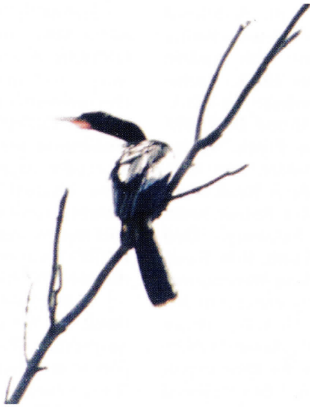
Figure 2: Definitive alternate/basic male Anhinga at Delaware, Middlesex , from 16 July to 16 September 2000.