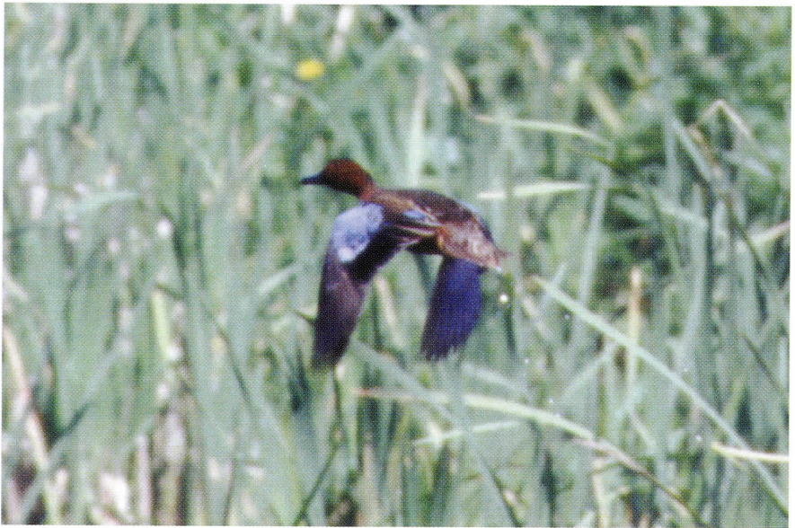
Figure 3: Alternate male Cinnamon Teal at Thunder Bay, Thunder Bay , on 3 June 2000.