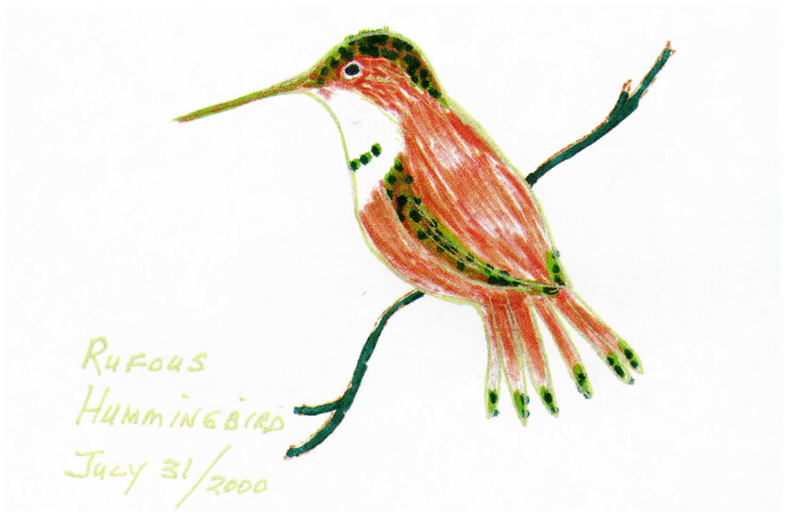
Figure 7: Male Rufous Hummingbird at Nipigon, Thunder Bay , from 31 July to 2 August 2000. Sketch by Lola Grimes .