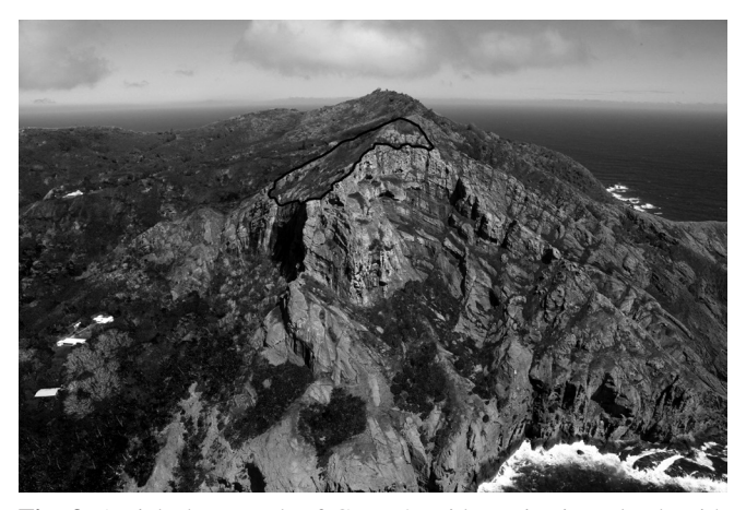
Fig. 3. Aerial photograph of Garnet's Ridge, Pitcairn Island, with the location of the Kermadec Petrel nests outlined in black.