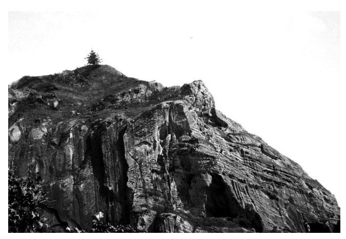
Fig. 2. Kermadec Petrel nesting site on part of Garnet's Ridge, Pitcairn Island. Nests were located in the vegetation just above the cliff.

We thank the captain and crew of the M/V Claymore II for transport to Pitcairn, the Government of the Pitcairn Islands and Pitcairn Island Council for permission to work on the island, and the residents of Pitcairn Island for sharing their knowledge and experiences. The Royal Society for the Protection of Birds, the UK partner in BirdLife International, funded this work. Comments from anonymous reviewers improved this manuscript.