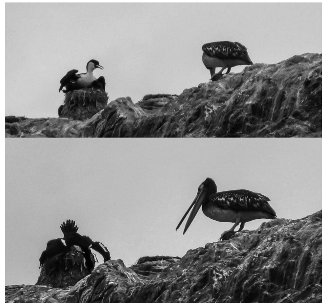
Fig. 3. Behavioral displays of an Imperial Cormorant defending its clutch in the presence of a juvenile Peruvian Pelican (Caicura Island, southern Chile).