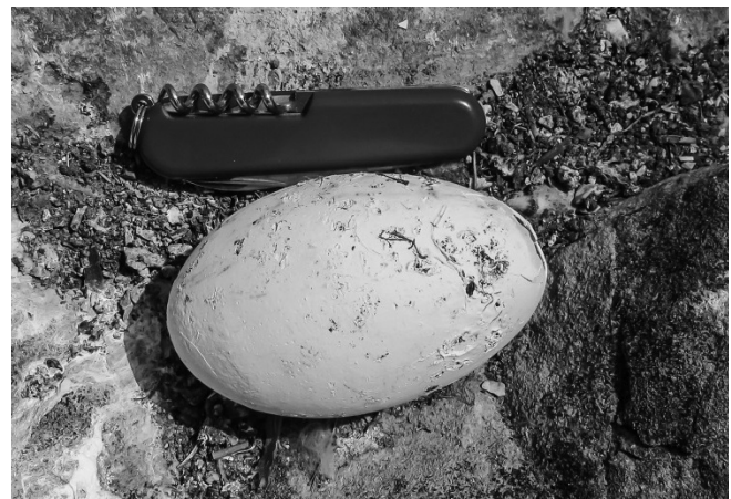
Fig. 2. The Peruvian pelican egg found in Caicura Island, southern Chile, in December 2013.

The recording of Imperial Cormorant nesting pairs at Kaikué-Lagartija Island, which were subsequently displaced by pelicans, is the first indication of competitive interactions between pelicans and other seabirds of Patagonia. The pelicans are well known for their aggressive behavior toward other seabird species in the Humboldt Current region, including often usurping nests (Duffy