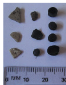
Fig. 2. Plastic load collected from a Short-tailed Shearwater in which the black, coiled pellets (right) were completely blocking the pylorus. The image also shows the general mixture of pellets and fragments, and the predominance of dark or black plastic.

High incidence of plastic ingestion, and greater mass and number of items in shearwaters than in other species, has also been