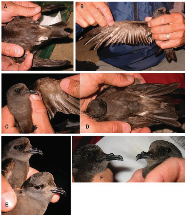
Fig. 2: Dark-rumped Leach's Storm-Petrels (LESP) and Ashy Storm-Petrels (ASSP) captured in mist-nets in the California Channel Islands: (A & B) LESP captured 16 August 2004 at Santa Barbara-Sutil islands (SBI) (rump score = 9), showing brownish underwing coloration; (C & D) LESP captured 18 August 2004 at SBI (rump score = 9), showing brownish underwing coloration; (E) LESP above and ASSP below captured 16 August 2004 at SBI, showing differences in bill shape and more posterior, longer and more pronounced gape in LESP; (F) LESP on left and ASSP on right, showing differences in bill morphology and more posterior extent of gape in LESP.

1977, 18 net nights were conducted between 28 May and 8 July at several locations around the island.