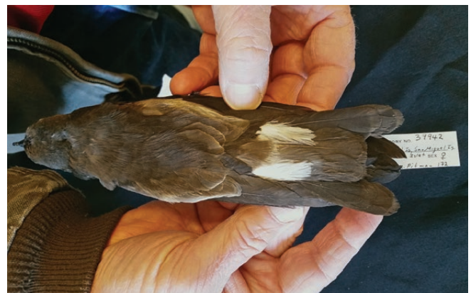
Fig. 3: Leach's Storm-Petrel (SDNMH #39942) captured by R.L. Pitman and S.M. Speich on 23 June 1976 at Prince Island, California.

Ainley (1980) and Power & Ainley (1986) reported two LESP specimens from the San Miguel Island area: SDNMH 39942 (Fig. 3) from PI in 1976 (rump score = 4) and USNM 544522 (Castle Rock; 14 May 1968; rump score = 10). USNM 544522 was later re-identified as an ASSP (see Carter et al. 2016a), and