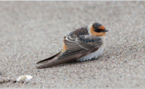
Figure 1. A first basic Cave Swallow at Point Pelee National Park, 13 November 2012.