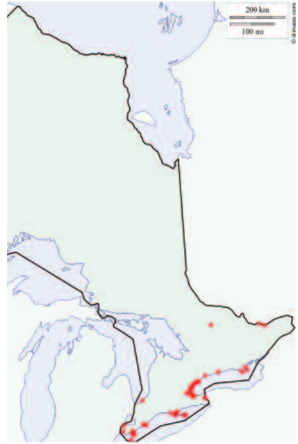
Figure 6. General distribution of Cave Swallow records in Ontario (in red).

Determining noteworthy geographic patterns can be challenging in a province as large as Ontario, where the human population is heavily situated around the lower Great Lakes. Yet, here a pattern emerges, with the majority of records