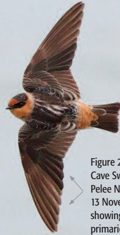
Figure 2. A first basic Cave Swallow at Point Pelee National Park, 13 November 2012, showing light outer primaries contrasting with dark inner primaries.

the more common and closely related Cliff Swallow ( P. pyrrhonota ). Adult Cliff Swallows are distinguished by a combination of their dark throat, pale foreheads and generally more contrasting appearance (Figure 3). Adult Cliff Swallows from the southwestern regions ( P. p. melanogaster ) of their range show rusty foreheads, much like Cave Swallows although this subspecies is currently unrecorded in the province. These “southwestern” birds should be considered (especially in spring) when potentially encountering a vagrant Cave Swallow. Here it would be important to note the finer plumage details of a potential vagrant, as the southwestern Cliff Swallow will have a darker throat than the Cave Swallow. In the fall, juvenile Cliff Swallows can show dark or dusky foreheads with pale throat patterns. They are generally less buffy-orange than Cave Swallows and do not show the contrasting primaries expected by the young-of-the-year Cave Swallows that have been recorded in Ontario in late fall. As noted,