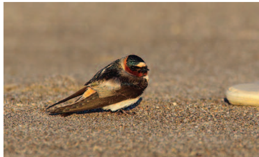
Figure 3. An alternate Cliff Swallow at Point Pelee National Park, 9 May 2010.

the majority of Cave Swallow records in Ontario occur from late October through November, long after most Cliff Swallows have left our borders. A large group of Petrochelidon swallows observed in November is likely to be Cave Swallows. It is with single or observations outside of the traditional late-fall window that require extended study and careful consideration when separating these species, subspecific vagrant or late Cliff Swallows must be considered when documenting a sighting.