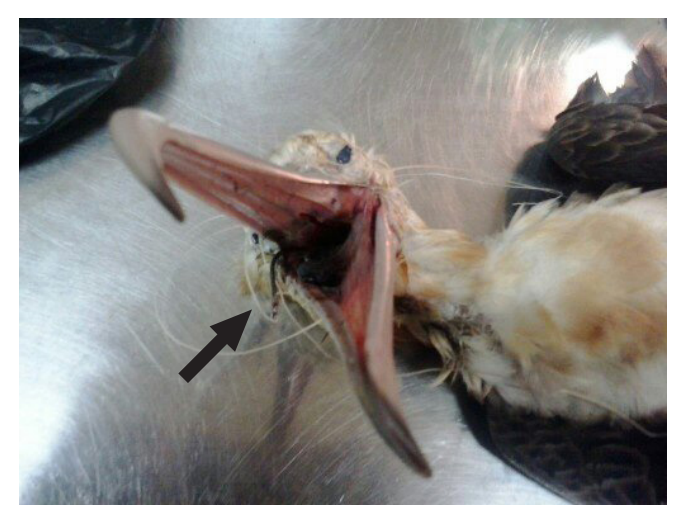
Fig. 2: Juvenile Christmas Island Frigatebird entangled in fishing gear found dead in Jakarta Bay, Indonesia, in April 2013. The arrow points to the hook in the bird's bill.

In March 2013, local people observed a fisherman throwing fish overboard from his fishing boat, specifically aimed at Christmas Island Frigatebirds, which readily took the bait from the water surface. Apparently, the bait was poisoned or contained a sedative,