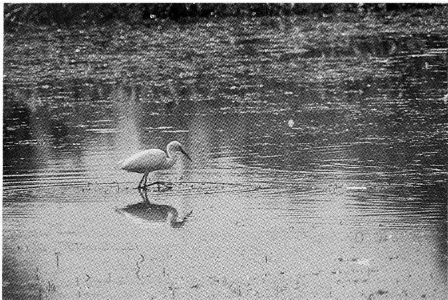
Figure 2: Snowy Egret at McGeachy's Pond, Erieau, Kent from 11 to 23 August 1992.