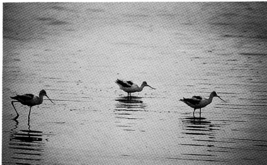
Figure 4: Three juvenile American Avocets at Windermere Basin Hamilton-Wentworth on 23 August 1993.

This was a good year for sightings of this spectacular shorebird, but we still notice that not all the reports on the hotlines translate into submissions to the OBRC.