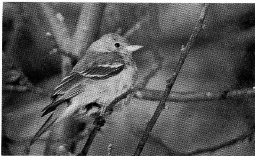
Figure 8: Female Western Tanager at Port Colborne, Niagara on 6 December 1992.

During its prolonged stay, this bird visited several feeders in an older residential neighbourhood in the north end of the city, so was often frustratingly difficult to find on any given day.