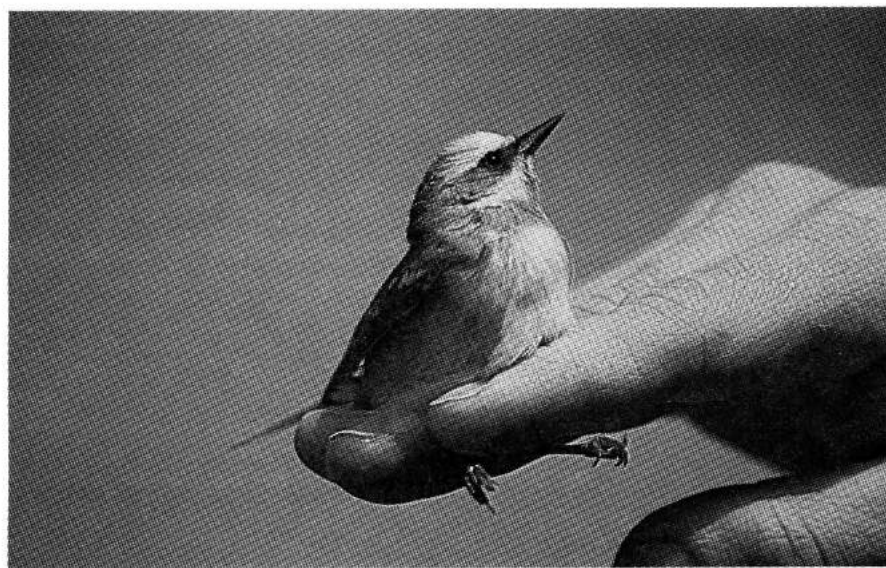
Figure 7: Adult female Lawrence's Warbler at Long Point, Haldimand-Norfolk on 11 May 1993.

thern Ontario. It was interesting to note that the first record for the Sault Ste. Marie area was of the less expected, yellow-lored subspecies, D. d. dominica . The photograph was examined by Kenneth C. Parkes of the Carnegie Museum of Natural History in Pittsburg, who pointed out additional field marks, including the finer flank streaking characteristic of this race.