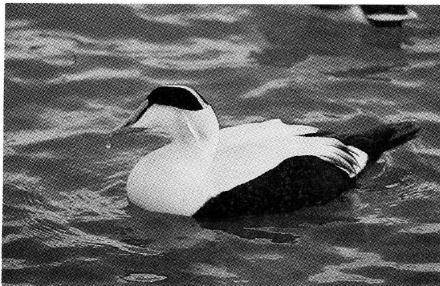
Figure 3: Male Common Eider at Sunnyside Beach, Metropolitan Toronto in December 1971.

1992 — one adult, 28 June, Rainy River, Rainy River (P. Allen Woodliffe).